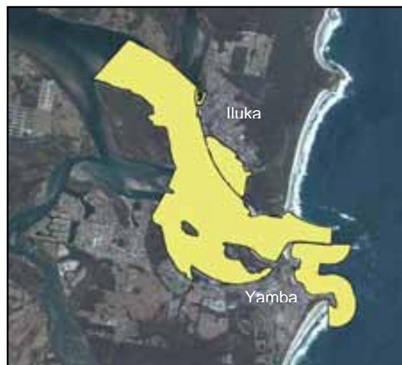
Figure 1. Clarence spearfishing closure