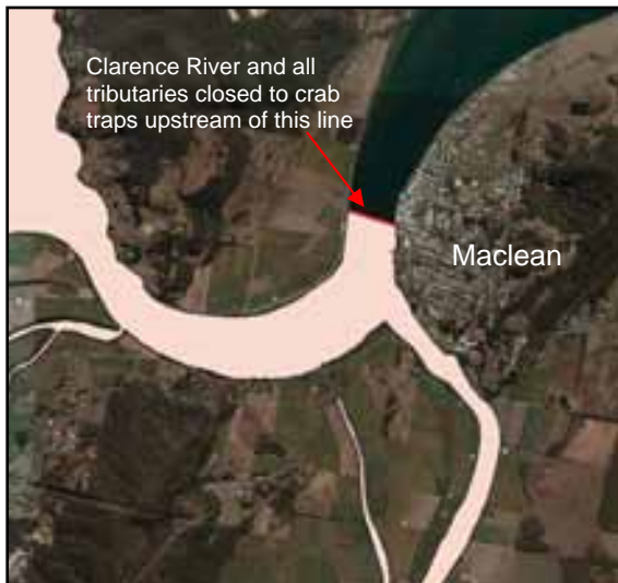
Figure 3. Crab Trap Closure

All traps are prohibited in Lake Arragan (north of Brooms Head in Yuraygir National Park).