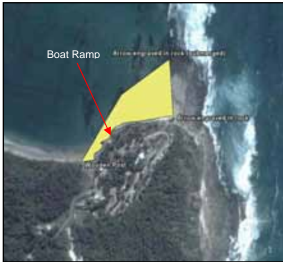
Figure 2. Woody Bay spearfishing closure