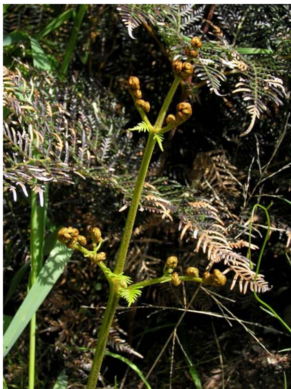
Figure 2: A new frond about to unfurl.

Bracken spores are produced and usually dispersed in late summer to autumn. This can vary in different years and across different locations. Spores germinate in moist, sheltered situations.