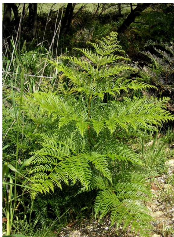
Figure 1: A bracken fern plant. L. McWhirter

Bracken is a perennial fern, but the fronds emerge in the spring and die off in autumn. In colder areas fronds will live for only one year, but they can live for two years where conditions are milder