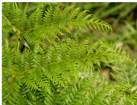
Figure 3: Close-up of a mature frond. L. McWhirter.

The second is more chronic and involves a combination of passing red-coloured urine,