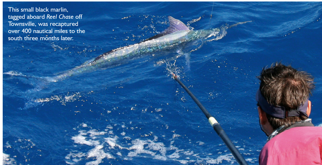
This small black marlin, tagged aboard Reel Chase off Townsville, was recaptured over 400 nautical miles to the south three months later.

This southward migration is a common trend with the fish over one year old (15-25 kg), where the fish follow the warm