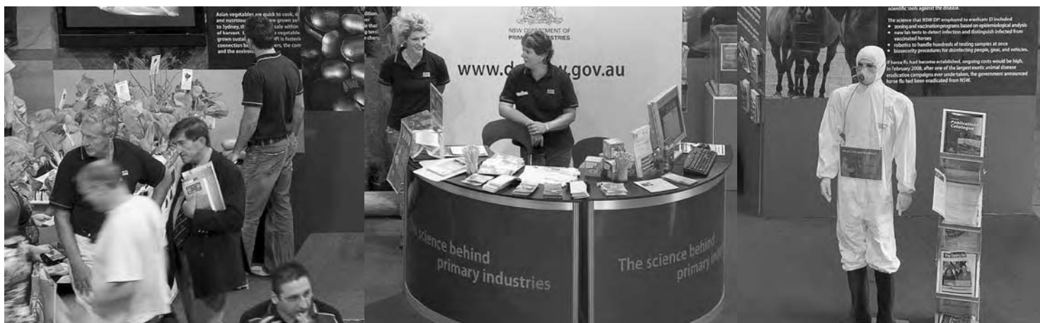
A focus on science and in particular the science behind the EI campaign attracted thousands of visitors to NSW DPI’s award winning stand at the 2008 Sydney Royal Easter Show.

Drought and climate change were the other big issues. Agriculture Today, NSW DPI’s newspaper published with “The Land” monthly, highlighted advice and initiatives to assist farmers in managing climate change and the impacts of the ongoing