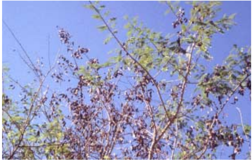
Mature trees can produce large numbers of seed pods, each containing up to seven seeds: Darwin Botanic Gardens, NT, in August.

There is also the potential for reintroduction of cutch tree, either accidentally or deliberately, in imported material from its homeland. The long life of its seeds and the economic value of this tree in its home environment add to this threat.