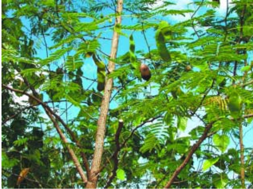
This regrowth had reached a total height of almost 5 m and was bearing seed pods approximately 2 years after the initial treatment: Darwin High School, NT, in April.