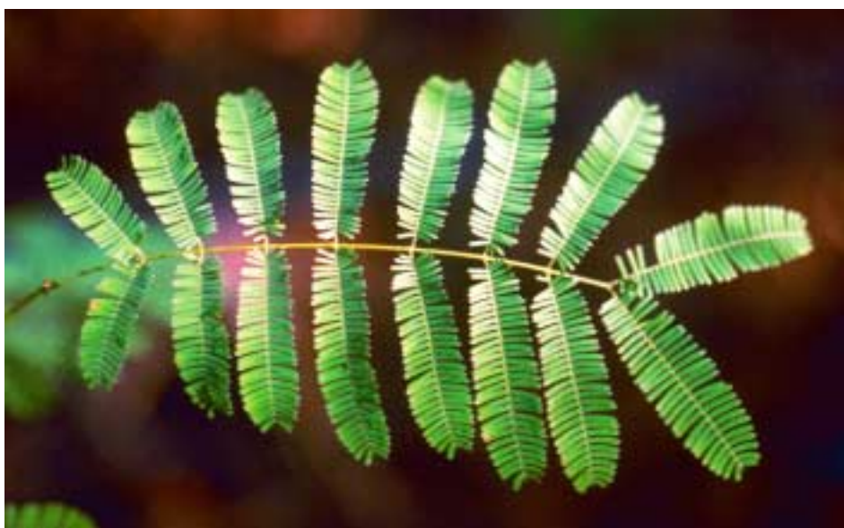
Cutch tree leaves are fern-like and made up of 8–30 pairs of smaller, secondary leaves.

Cutch tree is a small tree, growing 3–15 m high. The stem is dark brown to black, with rough bark which peels off in long strips in mature trees; young trees have corky bark. The fern-like leaves are 100–200 mm long and contain between 8 and 30 pairs of small leaves made up