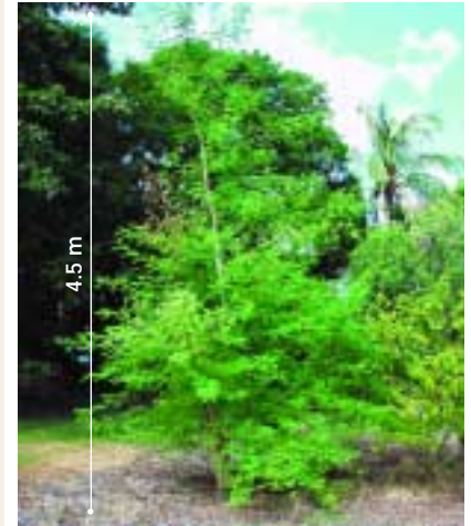
Catch tree grows well in open areas but will not set seed or reshoot under a dense canopy: Darwin High School, NT, in April.