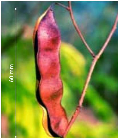
Seeds drop from the beaked seed pods during the dry season: Darwin Botanic Gardens, NT, in August.

The importation of catch tree into Australia is not permitted because of the risk of further spread, and the potential introduction of new genetic diversity that could make future control more difficult.