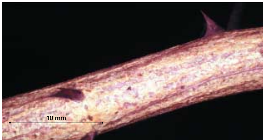
Thorns occur in pairs on the stem.

Catch tree will also resprout from the base if the main stem is removed and the cut stump is not treated with herbicide. The regrowth is frequently very dense and composed of numerous stems.