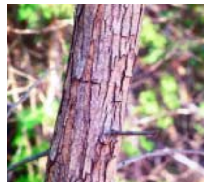
The bark of mature catch tree peels off from the stem in long strips.

Map: Base data used in the compilation of distribution map provided by Australian herbaria via Australia's Virtual Herbarium.