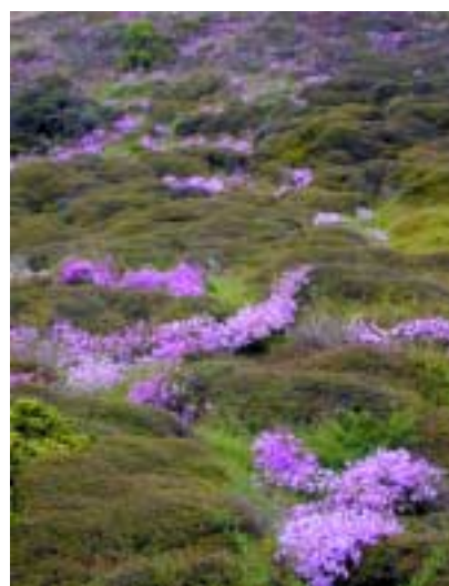
Holly leaved senecio is particularly invasive in open damp areas, and has the ability to dominate understorey vegetation in these conditions.

Holly leaved senecio can be confused with wild cineraria ( Senecio elegans ) at a distance, but up close the two plants are quite different. Wild cineraria is a much softer looking plant, with more succulent and hairy leaves and stems than holly leaved senecio. Wild cineraria is also an annual plant.