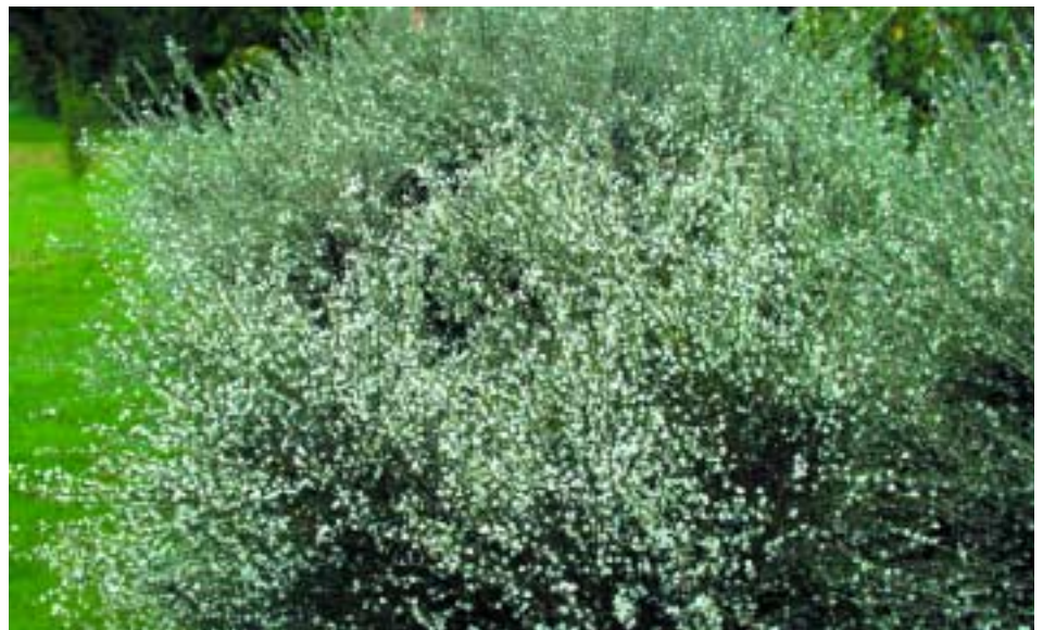
White Spanish broom is a large shrub which has striped green stems and green-grey foliage.

White Spanish broom is a large shrub which grows to 3 m high and has striped green stems. The leaves are arranged in groups of three leaflets on lower branches and a single leaflet on higher branches.