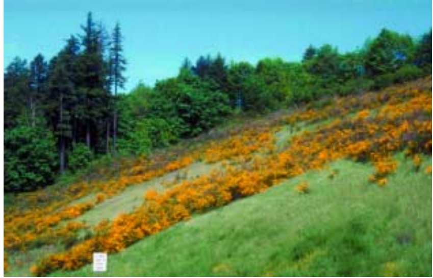
A closely related species, broom ( C. scoparius ), is already an established, serious agricultural and environmental weed in Australia.