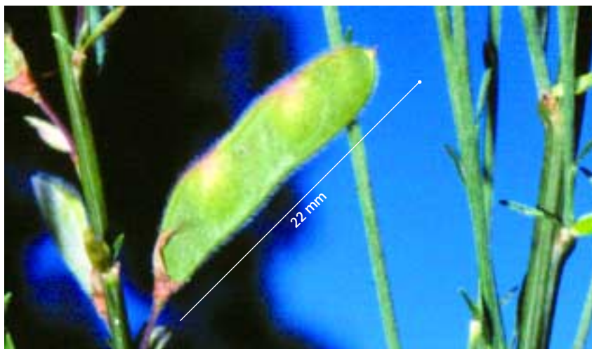
The seed pods of white Spanish broom are covered with short hairs, turn black when mature and release seeds explosively when ripe.

A closely related species, broom ( C. scoparius ), is already an established serious agricultural and environmental weed in Australia. It was introduced from Europe in the 1800s and has spread to many regions in southeastern Australia. It is a major problem in the Barrington Tops National Park in New South Wales and is also spreading in the Bogong High Plains in Victoria. More than 200,000 ha of land is estimated to be infested with C. scoparius and, despite many attempts at control, it is still spreading.