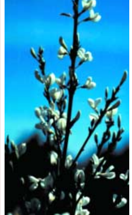
The flowers of white Spanish broom are white with a pink streak at the base.

White Spanish broom flowers prolifically from September to November but only a small proportion of flowers develop into fruit. Pods ripen over summer and seeds are released explosively on sunny days as the pods dry out. The seeds germinate with autumn rains and during spring although relatively few germinate at any one time. Plants grow throughout the year but mainly in the spring–autumn period, and usually do not seed until they are three years old.