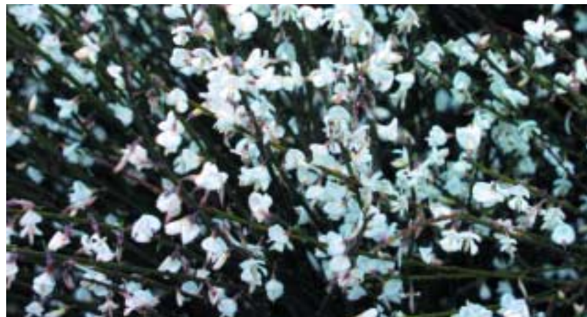
The key identifying characteristic of white Spanish broom is the white pea-like flower with a pink streak at the base.

Because there are relatively few white Spanish broom infestations, and it can potentially be eradicated before it becomes established, any new outbreaks should be reported immediately to your state or territory weed management agency or local council. Do not try to control white Spanish broom without their expert assistance. Control effort that is poorly performed or not followed up can actually help spread the weed and worsen the problem.