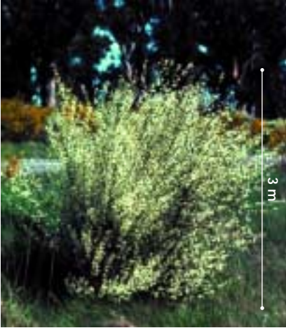
White Spanish broom has spread from lakeside plantings into roadsides and townships, but it could also establish in a wide range of disturbed and undisturbed habitats such as grasslands and open eucalypt woodlands.