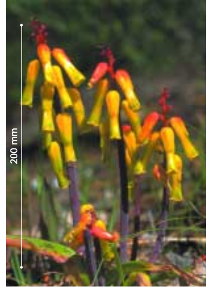
L. aloides has flowers in a range of colours including orange, red, yellow and greenish blue.

The various species of Lachenalia are similar looking, although there is some variation in plant size and flower colour. L. aloides grows 50–310 mm high and has flowers in a range of colours including orange, red, yellow and greenish blue. L. bulbifera grows 80–300 mm high and has orange to red flowers, with darker red or brown markings and green tips. L. mutabilis is the largest of the four species, growing 100–450 mm high, with pale blue and white flowers with yellow tips, and only one leaf. Yellow soldier ( L. reflexa ) is the smallest species (30–190 mm high) and has pure yellow flowers.