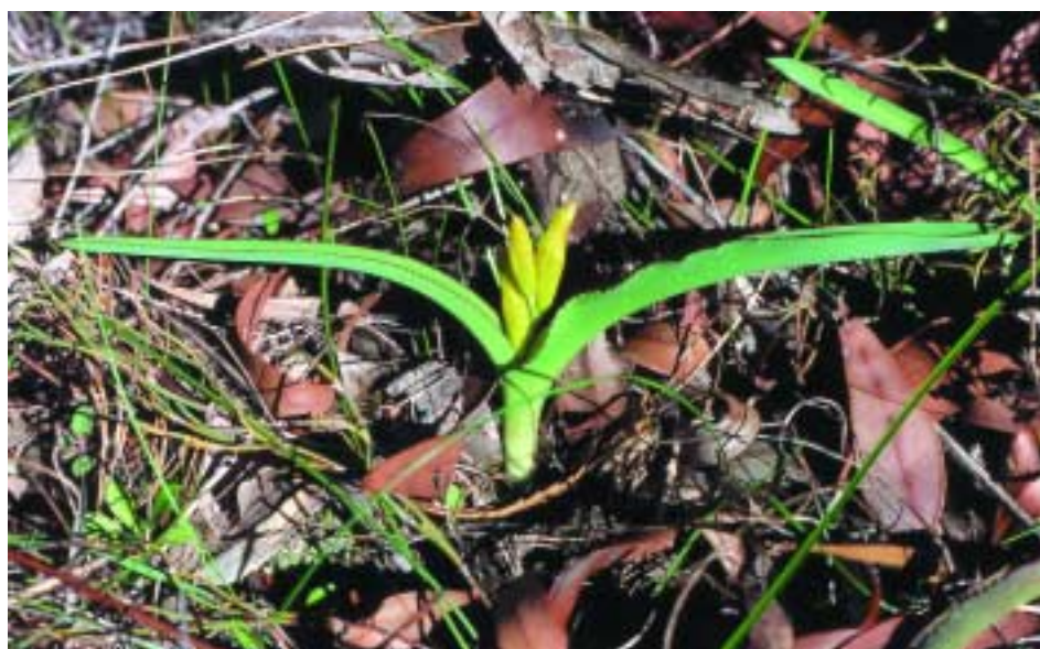
Yellow soldier has two strap-shaped leaves which are slightly V-shaped in cross-section.

Yellow soldier belongs to a group of South African plants, many of which are grown as garden ornamentals. Three other species of Lachenalia are weeds of Western Australia (see Box, p.3).