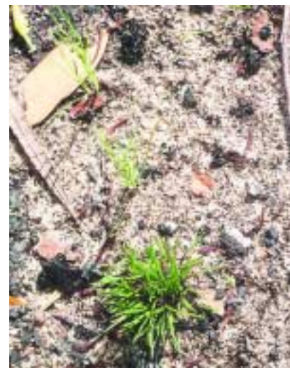
Yellow soldier appears to be tolerant of fire and regenerates soon after bushfires.

Once the initial infestation is controlled, follow-up monitoring and control will be required to ensure that reinfestation does not occur.