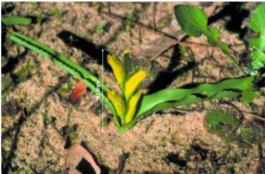
Yellow soldier is the smallest Lachenalia species and has pure yellow flowers.

The above contacts can offer advice on weed control in your state or territory. If using herbicides always read the label and follow instructions carefully. Particular care should be taken when using herbicides near waterways because rainfall running off the land into waterways can carry herbicides with it. Permits from state or territory Environment Protection Authorities may be required if herbicides are to be sprayed on riverbanks.