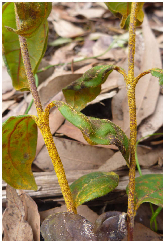
IMAGE: Myrtle Rust, advanced symptoms