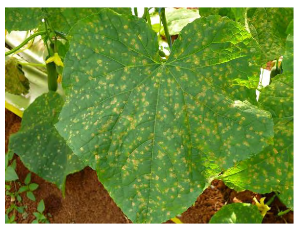
Figure 2. Downy mildew

Cause: Fungus – Pseudoperenospora cubensis