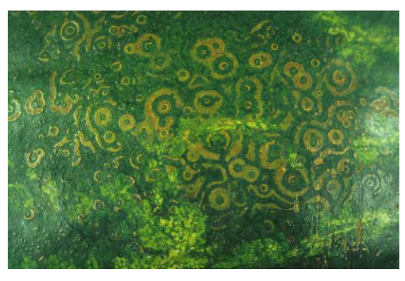
Figure 13. WMV-2 affected watermelon

Symptoms: Light and dark green mottling of the leaves. Distortion of leaves and stunting of the plant might occur. Marrow and summer squash fruit might show sunken concentric circles or a raised marbled pattern.