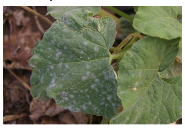
Figure 3. Powdery mildew

Symptoms: White powdery spots develop on leaves. Symptoms usually develop first on the underside of leaves before covering both sides. Leaves gradually turn yellow to a papery brown and eventually die.