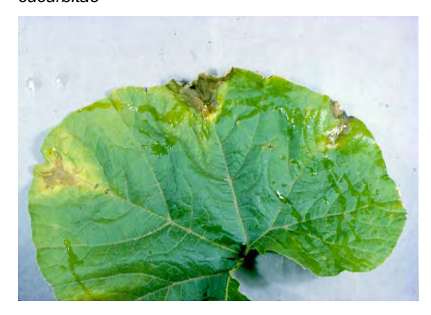
Figure 11. Bacterial leaf spot

Cause: Bacterium – Xanthomonas campestris pv. cucurbitae