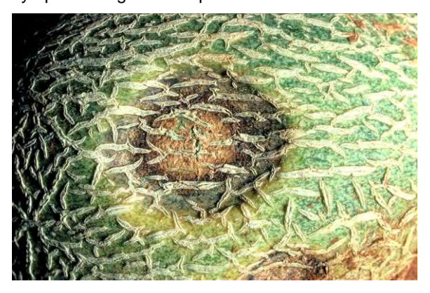
Figure 4. Anthracnose on rockmelon fruit

Symptoms: Brown to black spots develop on leaves; long dark spots develop on stems and round sunken spots develop on fruit. Fruit symptoms might develop in transit.