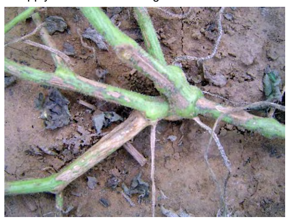
Figure 7. Gummy stem blight