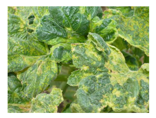
Figure 12. WMV-2 affected watermelon leaves

Cause: Watermelon mosaic virus (Type 1 and 2), papaya ringspot virus and zucchini yellow mosaic virus.