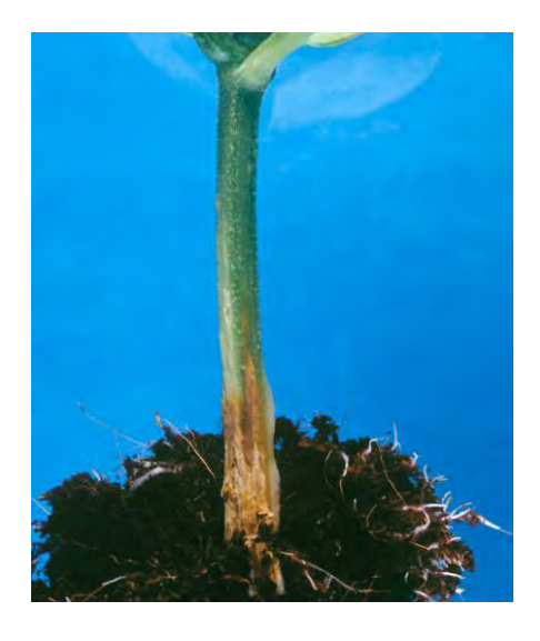
Figure 9. Damping-off of cucumber seedling

Careful irrigation management is important with drip under plastic.