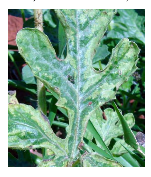
Figure 16. PRSV-W affected watermelon leaves