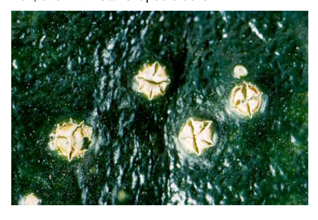
Figure 6. Septoria leaf spot

Symptoms: Leaf spots are brown with small, black, fruiting bodies. Raised spots develop on fruit, often with star-shaped cracks.