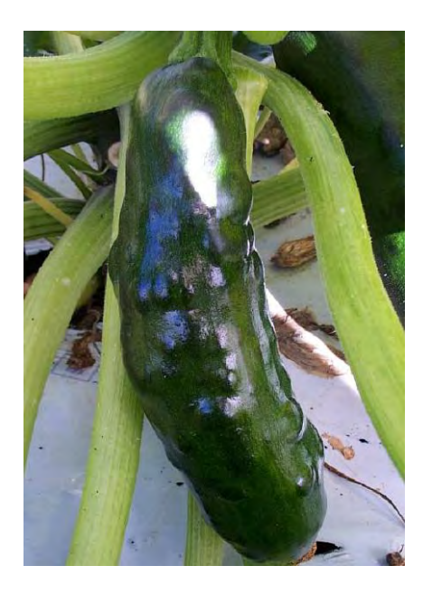
Figure 15. PRSV-W affected zucchini fruit