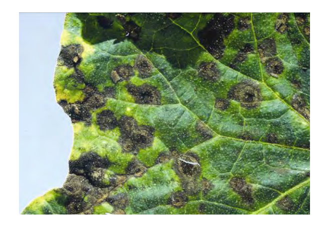
Figure 1. Alternaria leaf spot