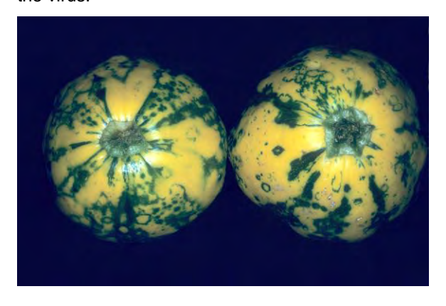
Figure 14. Watermelon mosaic virus on squash

Source of infection: Other mosaic-affected cucurbit crops and weeds. Spread by aphids that only need a very short period of feeding to transmit the virus.