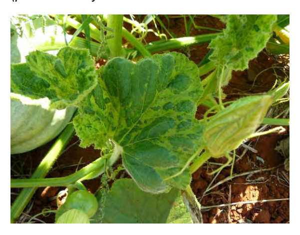
Figure 17. ZYMV affected leaves of Jarrahdale pumpkin