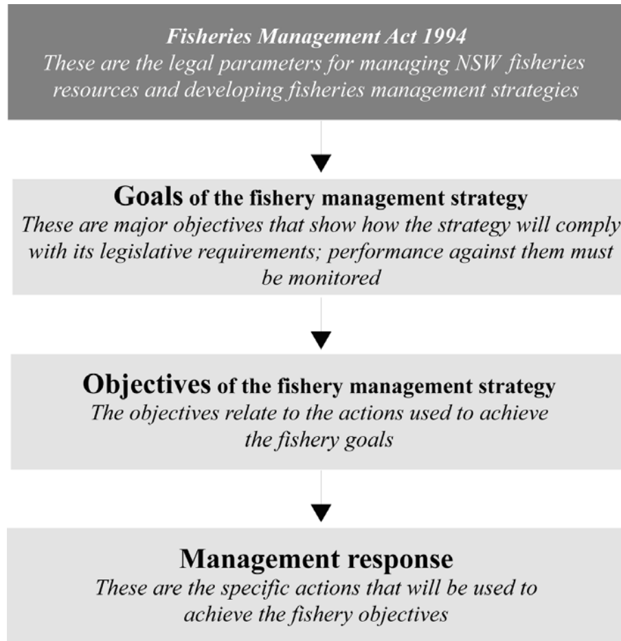
Figure 9.1 A model of the framework for a fishery management strategy.

The link between the goals, objectives and management responses is not as simple as that portrayed in Figure 9.1. The reality is that most management responses assist in achieving more than one goal and objective due to the complex relationships that exist, particularly in a multi-method multi-species fishery.