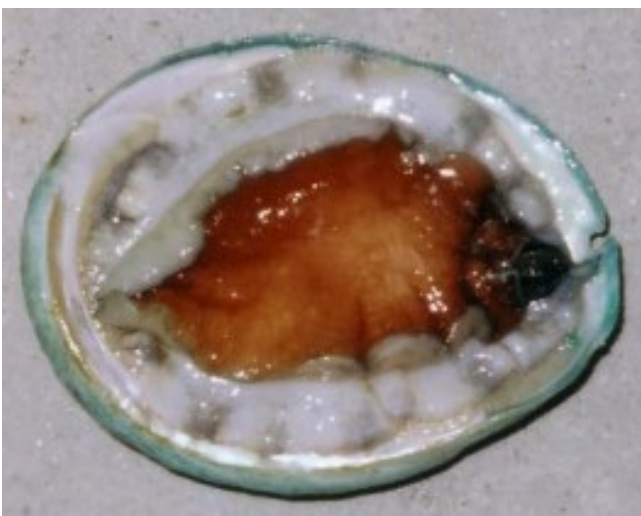
Figure 1 Diseased greenlip abalone displaying symptom of AVG – curling of the foot