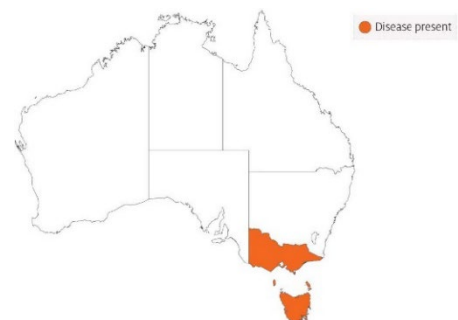
Figure 3: Presence of HaHV-1 by jurisdiction

AVG is not known to occur in wild abalone stocks in NSW.