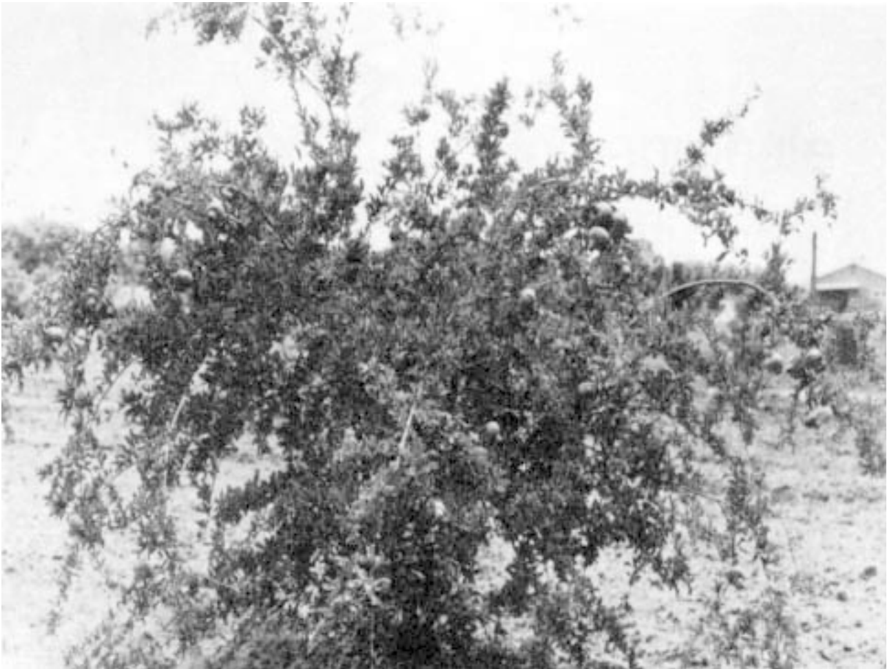
A young pomegranate tree starting to crop.

Nitrogen application should be split in lighter soils. Timing of application should be strategic to prevent excessive growth, delayed ripening and poor colouring of the fruit.