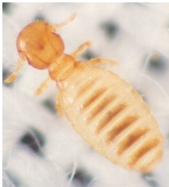
Figure 1. Adult sheep body louse.

When environmental conditions are favourable, female lice lay two eggs every three days. The eggs are white, microscopic and are attached to the wool fibre usually within 6–12 mm of the skin. Immature lice (nymphs) hatch from the eggs after about 10 days at which time they are much smaller than the adults. There are three nymphal stages or instars, which occupy seven, five and nine days respectively. The third instar nymph moults to an adult louse.