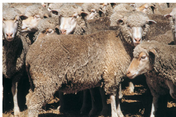
Figure 3. (above and below) Sheep infested with lice. The difference is the reaction of the sheep to lice infestation – the sheep below have damaged fleeces.

Newly infested sheep are very sensitive to lice. Others, which have had lice for long periods, can develop quite severe infestations but show few