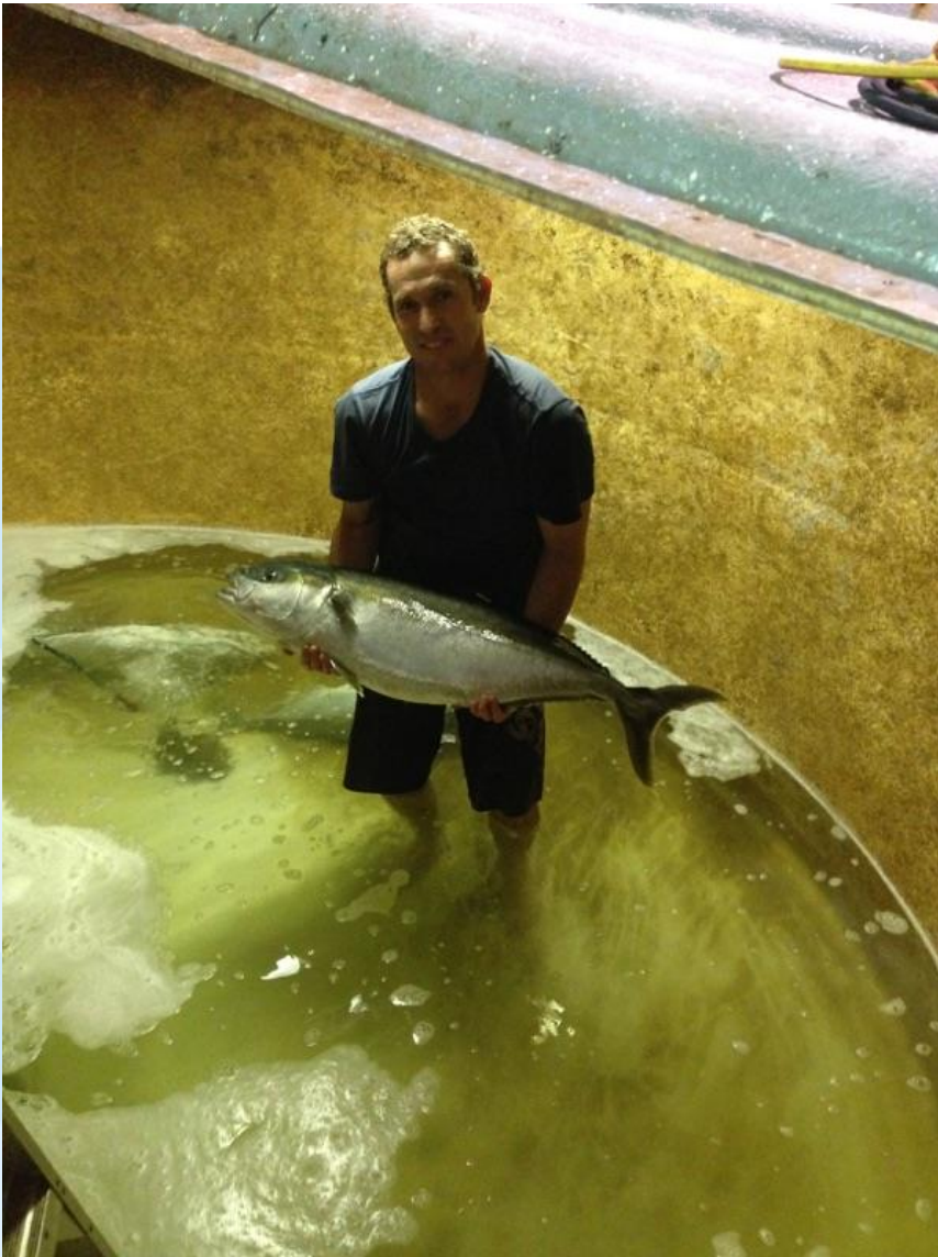
Light anaesthesia (10 ppm Aqui-S)