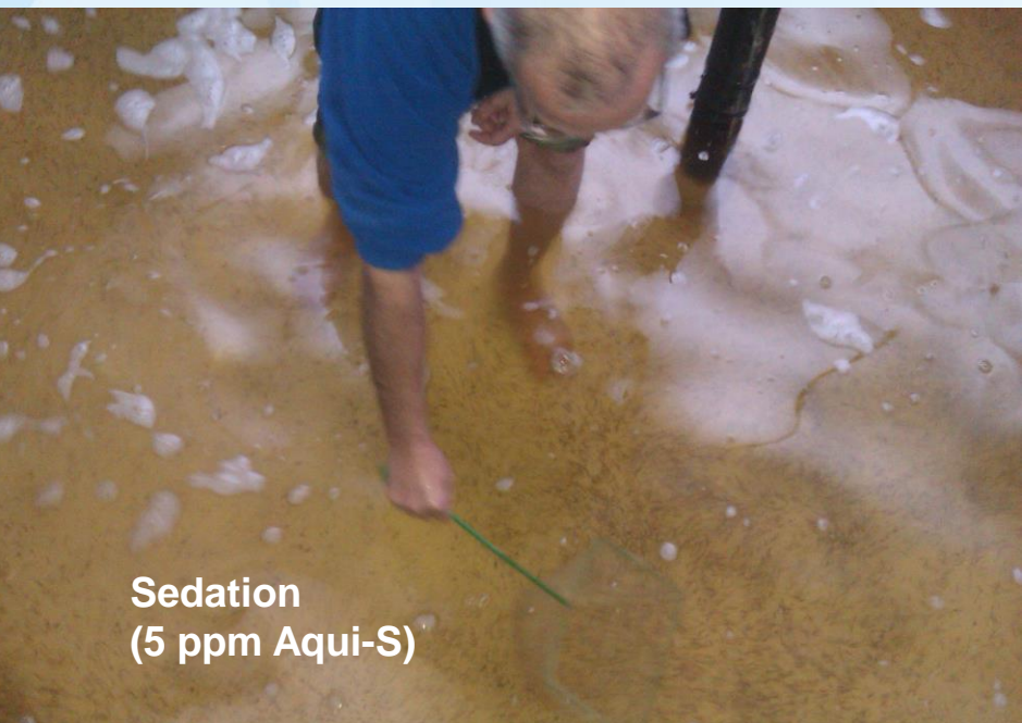
Sedation (5 ppm Aqui-S)