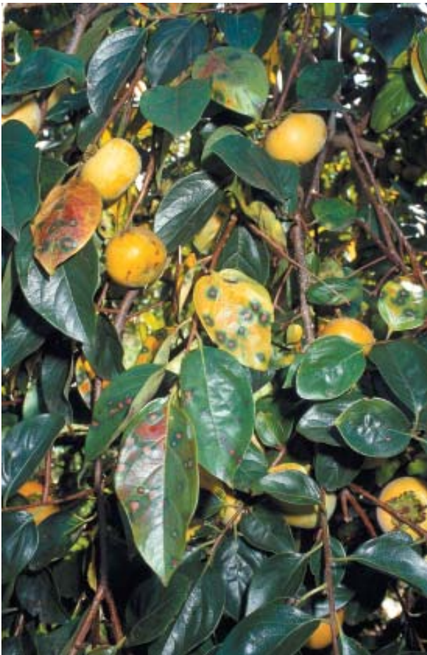
Figure 6. Circular leaf spot on Fuyu persimmon leaves. Heavy infestation can cause early tree defoliation. Cobbitty, New South Wales.

250g of nitrogen and 150–300g of potassium a year depending on soil fertility and crop load.