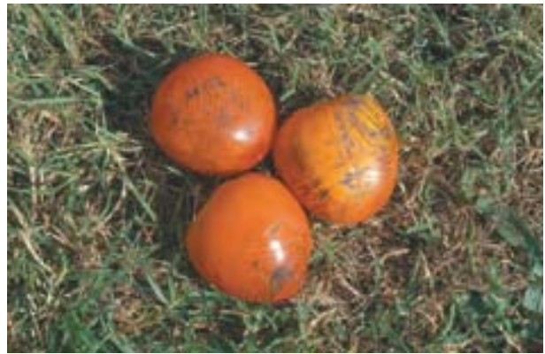
Figure 7. Skin russetting on Hachiya, Cobbitty, New South Wales.

The phosphorus requirement for persimmons is low compared to other deciduous fruit crops. Phosphate uptake by the plant is slow and, if needed, is best applied in autumn and incorporated into the soil. As an annual guide mature trees may need 30 to 40g of phosphorus. If a pasture cover crop (legumes and