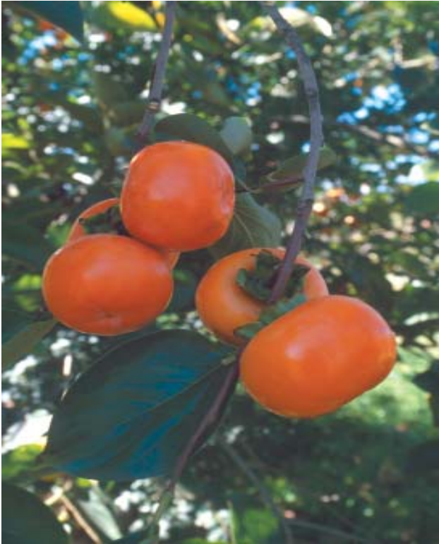
Figure 2. Flat Seedless, an astringent cultivar still grown in New South Wales, found mainly in older plantings.

Flowers are borne in the leaf axils of new growth from one-year-old wood. Normally two to four flowers are formed on new growth and open after the shoots and leaves have matured in spring. Female flowers are single, large and cream-coloured and easily distinguished from male flowers by their large dark green four-lobed calyx. Male flowers are smaller, occurring in two to three flowered clusters on small weak shoots.