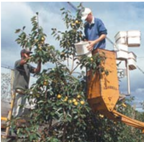
Figure 5. Mechanically aided harvest of palmette-trained Fuyu persimmons. Thirlmere, New South Wales.

some insect pests, such as mealy bugs, by eliminating fruit crowding. Thinning will also reduce biennial bearing, particularly if it is carried out at the flowering stage.