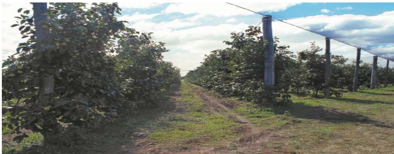
Figure 4. Hail netting over six-year-old Fuyu cultivars trained to a palmette system. Thirlmere, New South Wales.

Planting distances for a persimmon vary depending on cultivar, rootstock, soil type and tree canopy management used. As a guide, dwarf cultivars (Izu and Ichikikeri Jiro) can be planted at 5m x 2.5m (800 trees/Ha), semi-dwarf cultivars (Fuyu) at 5m x 3m (660 trees/Ha) and vigorous cultivars (Flat Seedless) at 6m x 4.5m (370 trees/Ha).