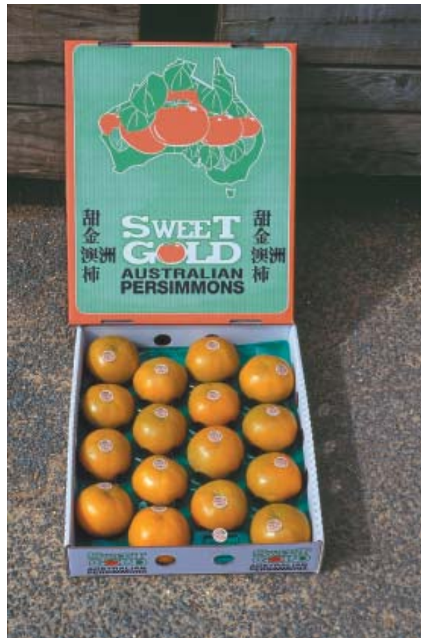
Figure 8. Fuyu persimmons packed in single layer tray for export. Thirlmere, New South Wales.

A combination of factors such as cultivar, age of tree, density and tree training system used can determine yields. The national average yield for persimmons from trees six years or older in 2000 was 16 t/ha. Mature Fuyu trees can yield up to 30 t/ha while more vigorous cultivars such as Flat Seedless can yield up to 40 t/ha. Some of the dwarf and semi-dwarf cultivars are precocious croppers and start cropping between 2 and 3 years after planting, especially in subtropical areas, while more vigorous cultivars like Flat Seedless in cooler areas may take longer. A persimmon tree reaches full bearing age at 8–10 years and can continue producing commercial crops for a further 15 to 20 years.