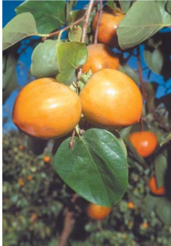
Figure 3. Hachiya, an astringent cultivar requiring care in handling. Suited for both fresh and drying.

Persimmons have proved to be highly adaptable to a wide range of climates in Australia, ranging from subtropical coastal regions of Queensland to mild coastal areas through to warm inland temperate areas