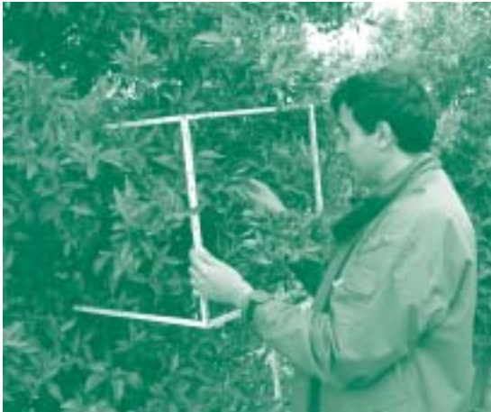
Placing the counting frame into the tree canopy