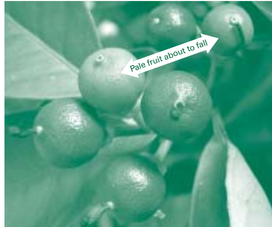
Fruits which are paler in colour are about to fall and should not be included in fruit counts.