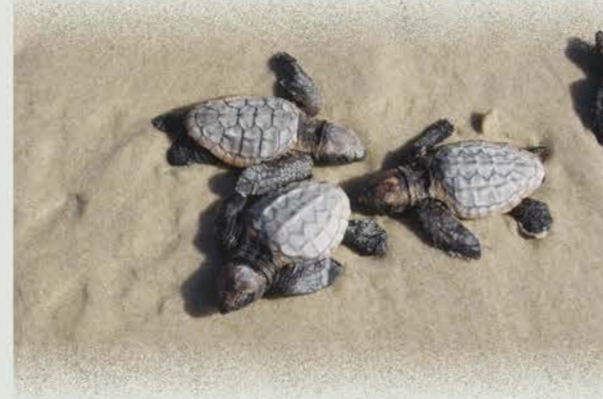
Baby Loggerhead Turtles, Cape Byron Marine Park (MPA)

Sites within the Marine Park that have been identified as particularly culturally significant to Indigenous people include Julian Rocks, Cocked Hat Rocks, Cape Byron and beaches around Broken Head.