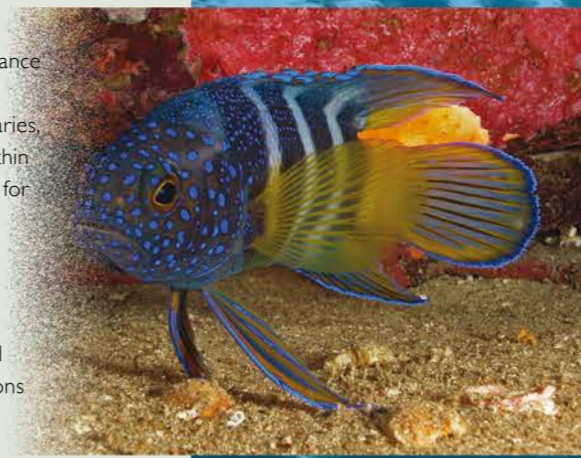
Eastern Blue Devilfish (David Harasit)

Five special purpose zones are included in the Marine Park and provide for: management of oyster leases in Marshalls Creek; a boat harbour in the Brunswick River; protection, traditional use and rehabilitation of Belongil Creek and Tallow Creek; and fishing from the board-walk at Lennox Head for people with a disability. Note, the Brunswick River Boat Harbour Special Purpose Zone is the only special purpose zone where fishing is permitted without a Marine Parks permit.