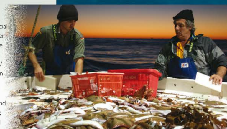
Commercial fishing (MPA)