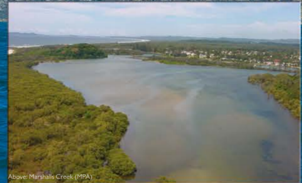
Above: Marshalls Creek (MPA)