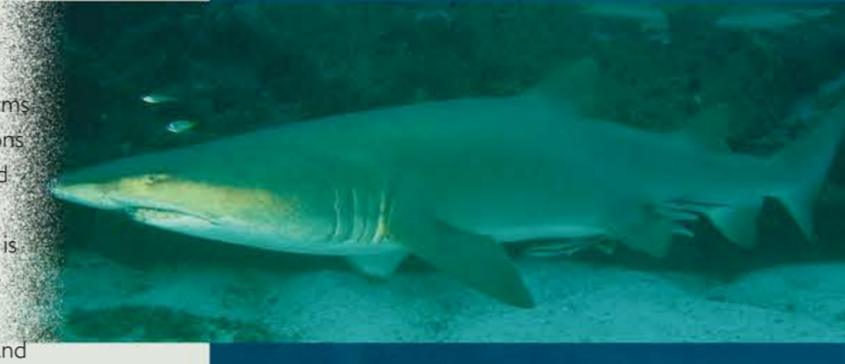
Grey Nurse Shark