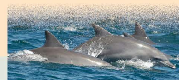
Dolphins, Cape Byron Marine Park (Liz Hawkins)

Subject to any other restrictions that apply under the Cape Byron Marine Park Zoning Plan or the Fisheries Management Act 1994 , species listed in Table 1 may be taken from habitat protection zones and the Brunswick River Boat Harbour special purpose zone, with the exception of Wilsons Reef and Bait Reef habitat protection zone, where Table 2 applies.