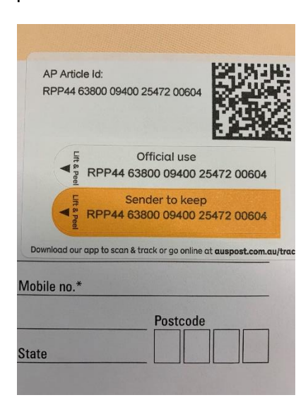
Figure 3. Registered mail tracking number

Samples should be mailed in an Australia Post mailbag via registered mail. The tracking number sticker for each mailbag labelled as 'Sender to keep' (see Figure 3) for each mail bag should be peeled off and retained in case the mail bag needs to be traced.