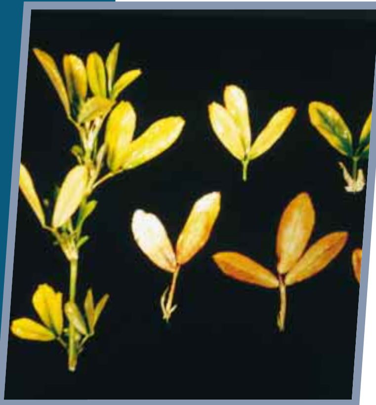
Lucerne leaves showing varying damage due to acidity