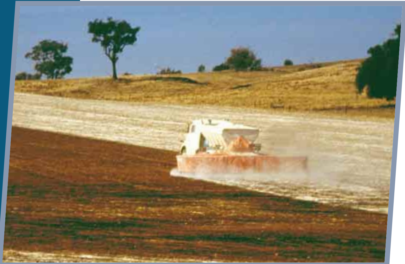
Lime application to reduce acidification in crops