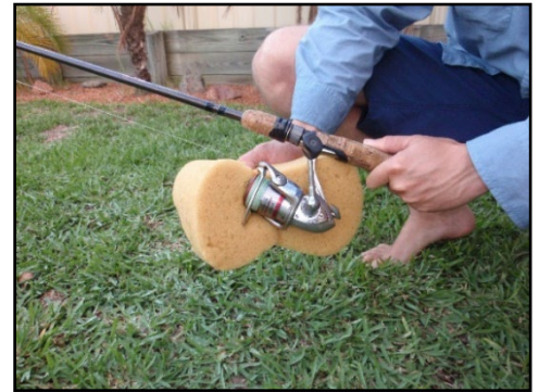
Figure 3 Washing down fishing gear