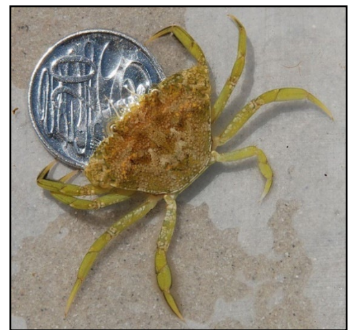
Figure 1 Introduced European Green Crab ( Carcinus maenas )

Pacific Oyster Mortality Syndrome (POMS) was detected for the first time in Australia in 2010 in the Georges River, then in Sydney Harbour in 2011. In January 2013 POMS was detected in the Hawkesbury River, where it caused significant negative impacts on the oyster farming industry. Some farmers reported up to 80% crop loss. NSW Department of Primary Industries implemented strict biosecurity conditions, restricting movement of oysters and oyster farming equipment, to limit the spread of POMS to other estuaries. This outbreak highlights the economic and environmental risk introduced pests and diseases pose.