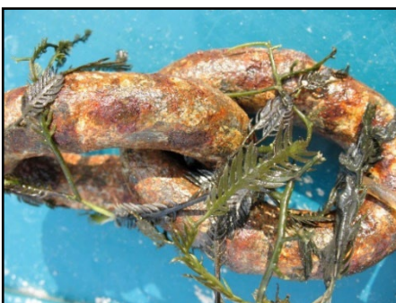
Figure 2 Fragment of introduced marine alga Caulerpa taxifolia on anchor chain