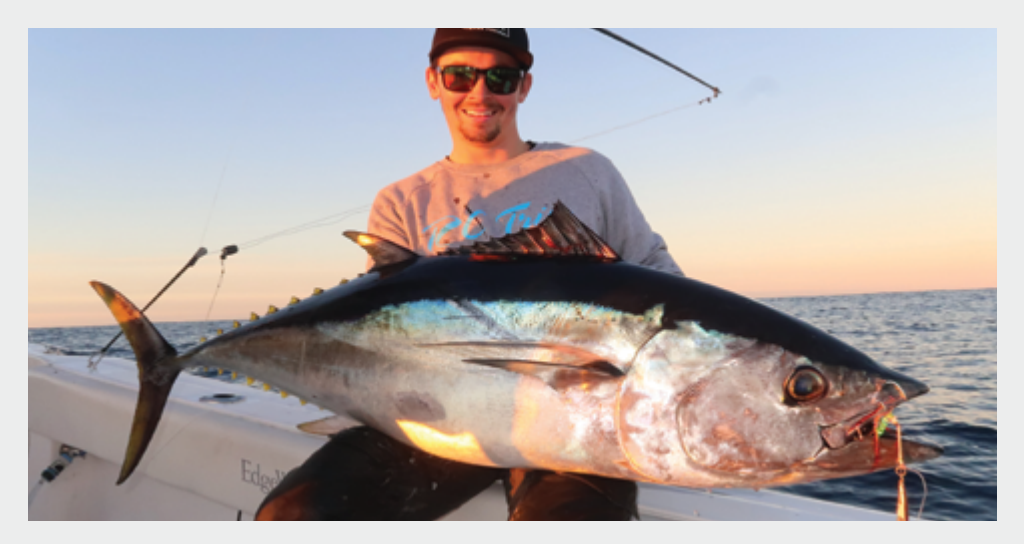
Continued from page 3