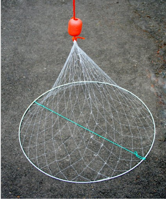
Image 1: A “witches-hat” - the float keeps the netting material off the bottom and the inverted mesh operates as an entanglement net.