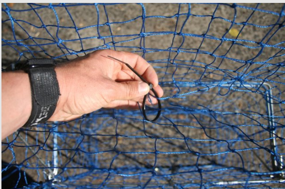
Image 3: A cable tie being used to reduce the size of the entrance of a crab trap.