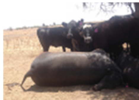
Cattle affected by salt poisoning.

The dam in question had been filled from a bore 18 months previously. The other dams on the property had been