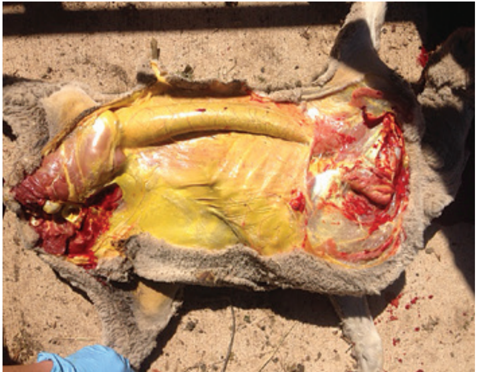
Liver damage in these sheep caused severe jaundice.

Necropsy of the two euthanased lambs revealed jaundice. Histopathological testing of livers and kidneys in the lab showed subtle megalocytosis