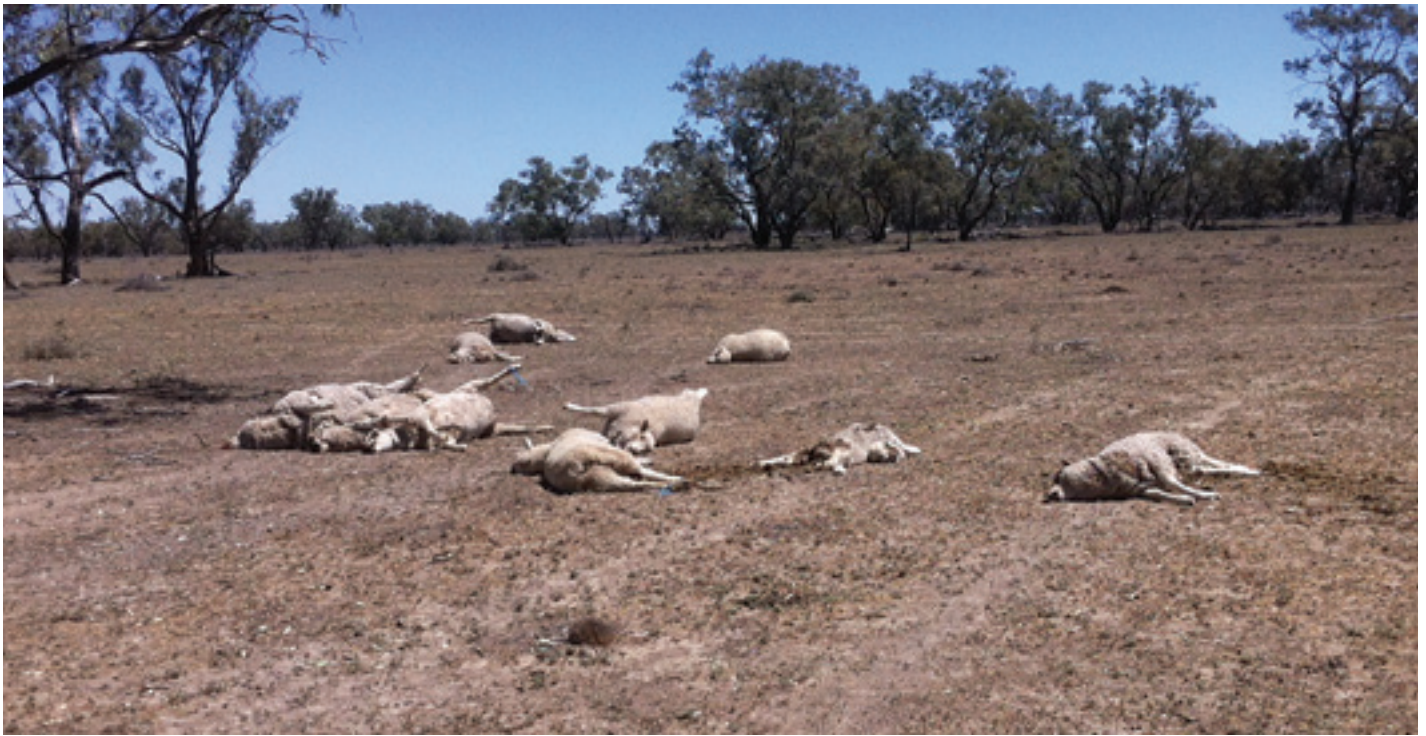
Many sheep died from the effects of the mould toxins.