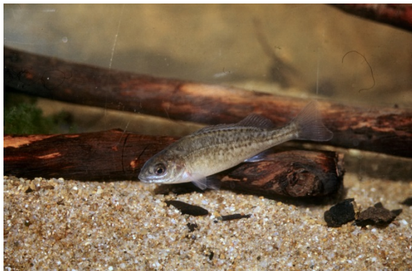
Figure 5: A juvenile Silver Perch