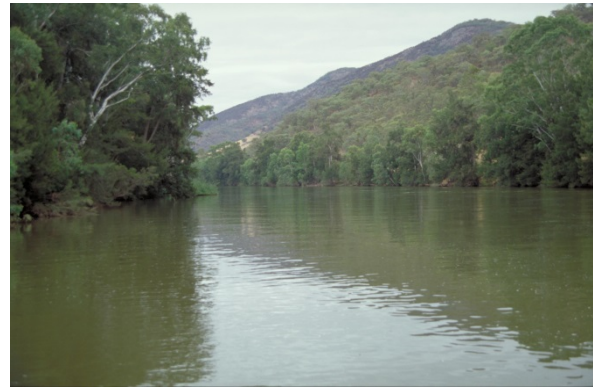
Figure 4: Silver Perch habitat