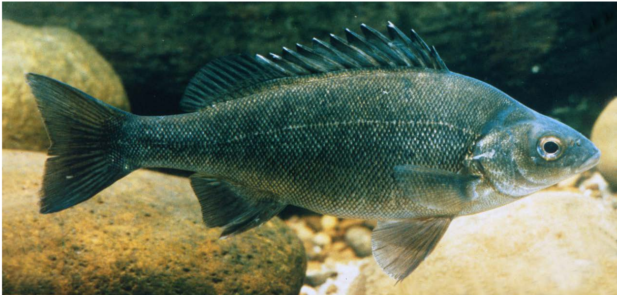
Figure 1: A Silver Perch (Photo; G. Schmida)

Threatened Species Unit, Port Stephens Fisheries Institute