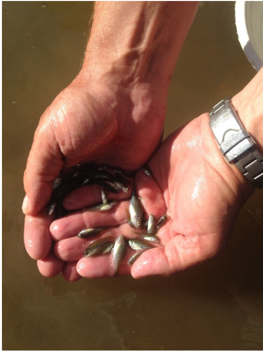
Figure 3: Silver Perch fingerlings produced as part of the conservation stocking program and released into the Namoi River in April 2017