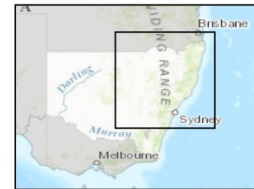
— Indicative Distribution

Distribution based on survey records, predicted occurrence (MaxEnt 3.3.3) and expert opinion. Output restricted to named streams with a modelled average daily flow of more than 5 megalitres. 2015.