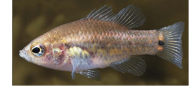
( Nannoperca oxleyana )