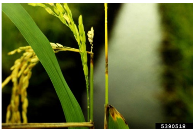
Figure 4 Neck rot symptoms of rice blast