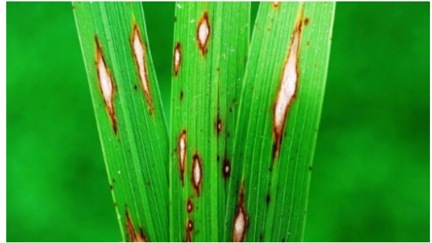
Figure 1 Rice blast lesions on leaves

Infected nodes appear black-brown and dry (Figure 3). An infection at the node often results in the stem breaking.