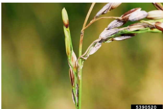
Figure 5 Panicle blast symptoms of rice blast