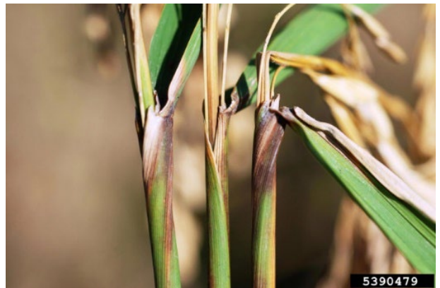
Figure 2 Collar rot symptoms of rice blast