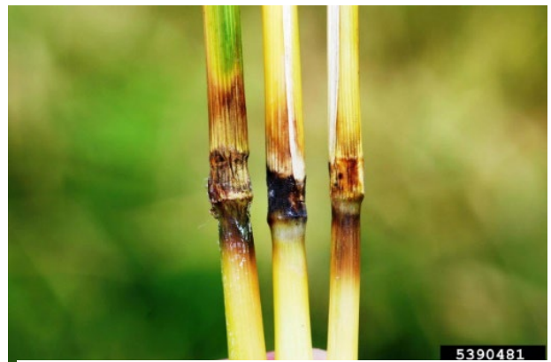
Figure 3 Node infection symptoms of rice blast