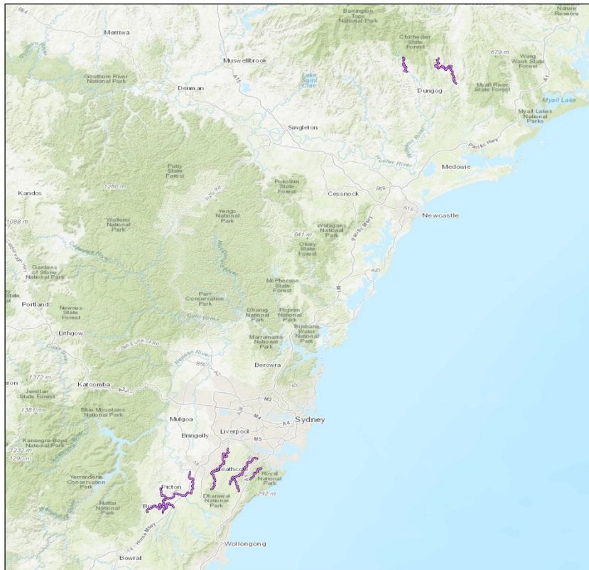
Indicative Distribution in NSW Sydney Hawk Dragonfly