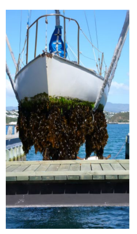
Figure 1 Heavily fouled vessel, sourced awe.gov.au 30.12.21

Importantly, marine pests can be introduced through biofouling, which compete with native species, create habitat changes, and introduce viruses and diseases. For those that love being in the great outdoors, such as boat owners, this may reduce the value of the very things in nature that you currently enjoy.