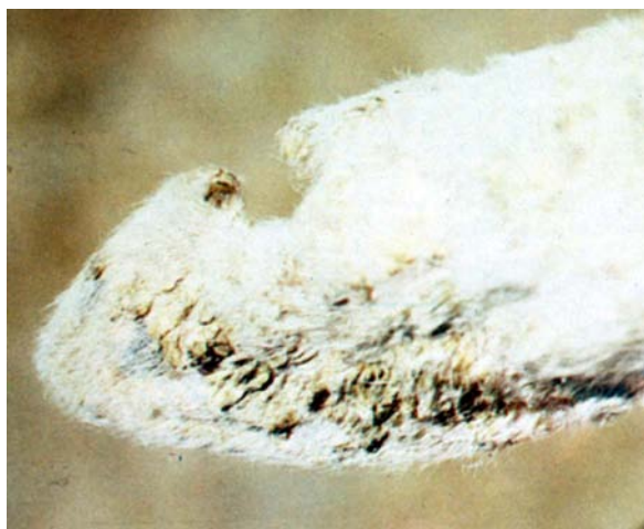
Small scabs such as these on the ears may be the only sign of infection on the animal.

Medium and strong wool Merinos are more susceptible to lumpy wool than crossbreds, fine wool Merinos or British breeds of sheep.