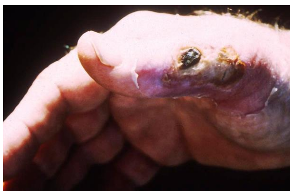
Figure 4 – Anthrax infection in humans – skin lesion

Anthrax vaccine is used to protect livestock from infection in NSW. Although the strain of anthrax used in the vaccine is not known to cause infection in people, extreme care should be taken when using the vaccine. Accidental self-injection with anthrax vaccine can cause an inflammatory reaction and medical advice should be sought immediately.