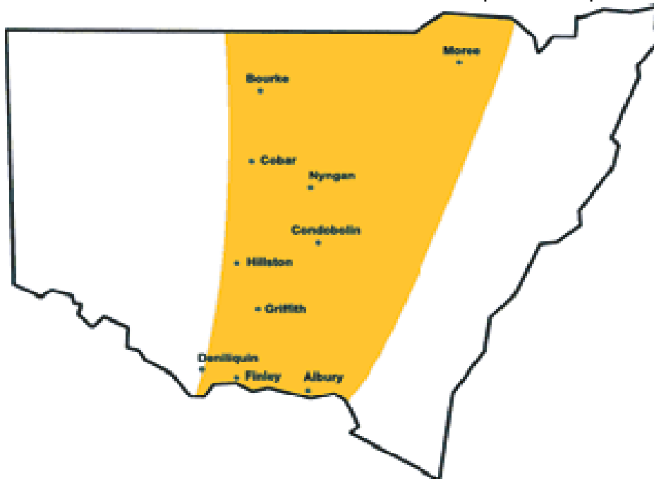
Figure 1 - Anthrax in NSW – almost all recent cases of anthrax in NSW have occurred within the highlighted region.

case in a district. An example of this is the serious incident which occurred in 2007 in the NSW Hunter Valley where anthrax had not been seen for over 60 years. It is essential that all stock owners in New South Wales remain aware of the disease and report all suspicious livestock deaths.