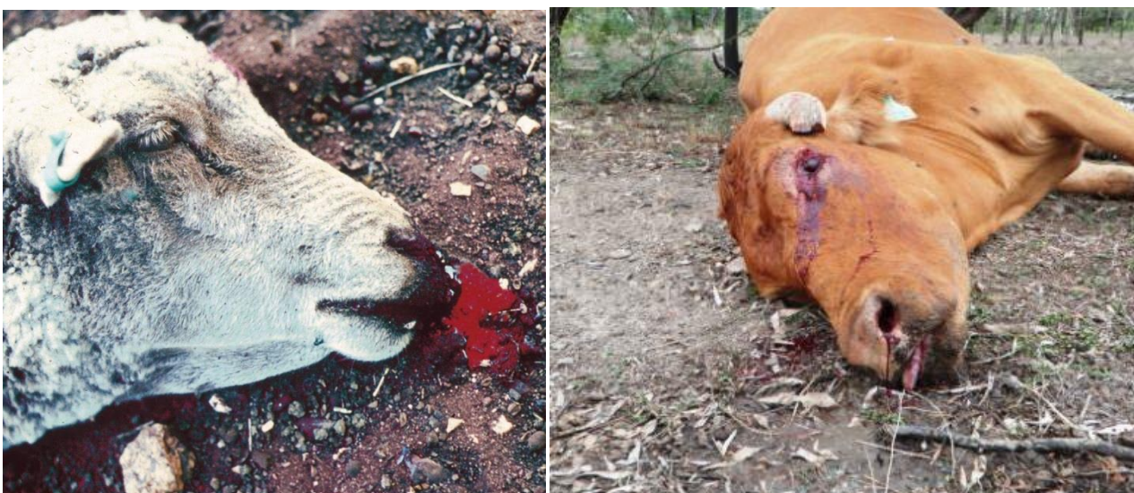
Figure 2 – A sheep and cow that have died from anthrax. Note blood dripping from eyes, nostrils, and mouth.

Dogs and cats are highly resistant but should be monitored carefully if they have had access to infected carcasses.