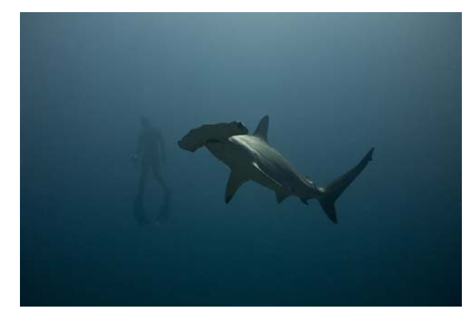
Scalloped Hammerheads are not considered dangerous to humans.