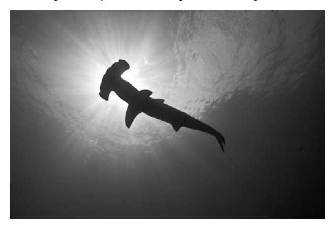
Scalloped Hammerhead silhouette

Juveniles are born at 46 - 56 cm and remain in nursery environments such as inshore estuaries or bays for up to a year or more. Scalloped Hammerheads have been recorded over 30 years old and some studies have estimated they may live as long as 50 years; making them a long-lived fish.