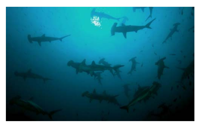
Large school of Scalloped Hammerheads

Adult Scalloped Hammerheads inhabit deep waters adjacent to continental shelves, in water depths ranging from the surface to at least 275 m in depth, while juveniles are found close to shore in nursery habitats. Adult females are thought to occupy deeper water and move into shallower waters to mate and give birth.