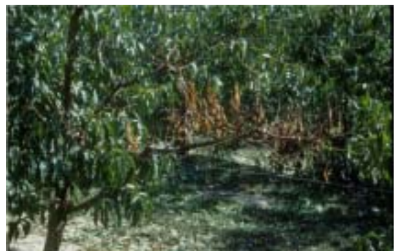
Figure 2. Branches on a peach tree killed by bacterial canker

Cankers girdle branches and kill them (Figure 2). There is often extensive suckering following infection.