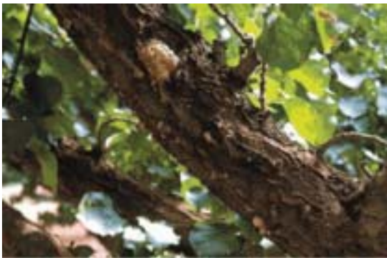
Figure 5. An active canker on a Trevatt apricot tree

When monitoring the orchard look for rough cankers with amber coloured gum (Figure 5). Sometimes gum is not produced but when the bark is peeled back the flesh of the tree is fermented, brown and sour smelling. Look particularly hard around crotches.