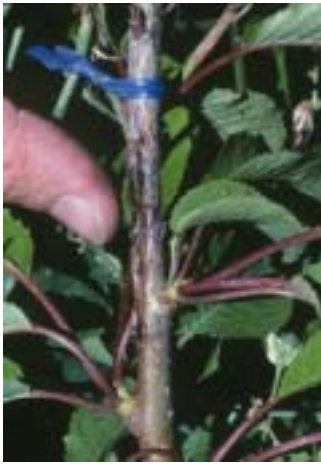
Figure 3. A canker formed from an infected leaf scar

Buds: Dormant buds become brown and fail to break. Behind the bud, an area of dead tissue develops on the shoot. This area may be sunken and appear brown and damp underneath.