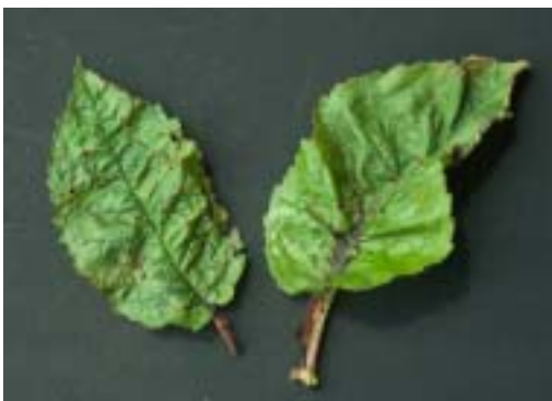
Figure 4. Cherry leaves showing symptoms of bacterial canker

Leaves: On younger leaves, infection appears as water soaked spots. As leaves age, the spots turn brown and drop out giving a 'shot hole' effect. Other symptoms can occur, such as thin, narrow, often rolled, yellow leaves particularly on peach and plum trees.