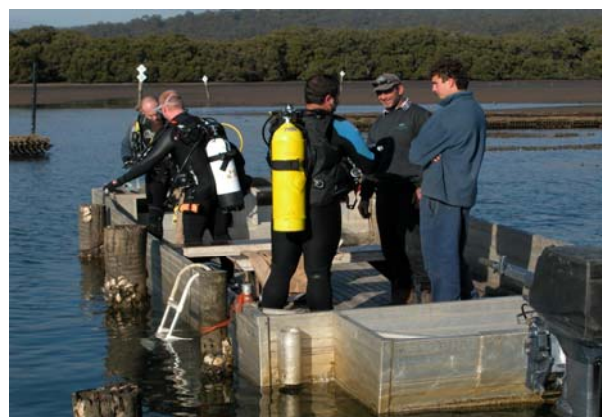
Volunteer divers in the Clyde River