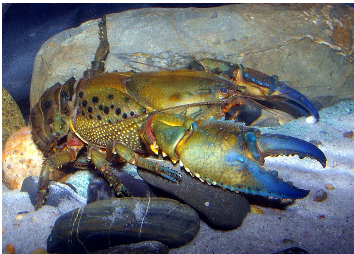
Figure 1. Euastacus vesper in a captive setting. Image does not depict the species' natural habitat ( McCormack and Ah Yong 2017 ).

Euastacus vesper is most easily distinguishable in the field from other large spiny crayfish in the area (i.e., E. armatus (Murray crayfish) ( von Martens 1866 ) and E. spinifer (giant spiny crayfish) ( Heller 1865 )) on the basis of colouration and spine patterns. Euastacus armatus , which can be sympatric with E. vesper , is recognisable by the white abdominal spines and claws (versus dark-green to blue, occasionally purplish in E. vesper ). Euastacus spinifer , the nearest phylogenetic relative, occurs to the immediate east of the range of E. vesper (but is not sympatric) often has similar colouration, but can be distinguished by having two instead of three approximately horizontal rows of branchial thoracic spines on the sides of the carapace. The three species also attain a different maximum size: E. vesper (max OCL = 71.6 mm), E. armatus (max OCL = 174 mm), and E. spinifer (max OCL = 117 mm: McCormack and Ah Yong 2017 ).