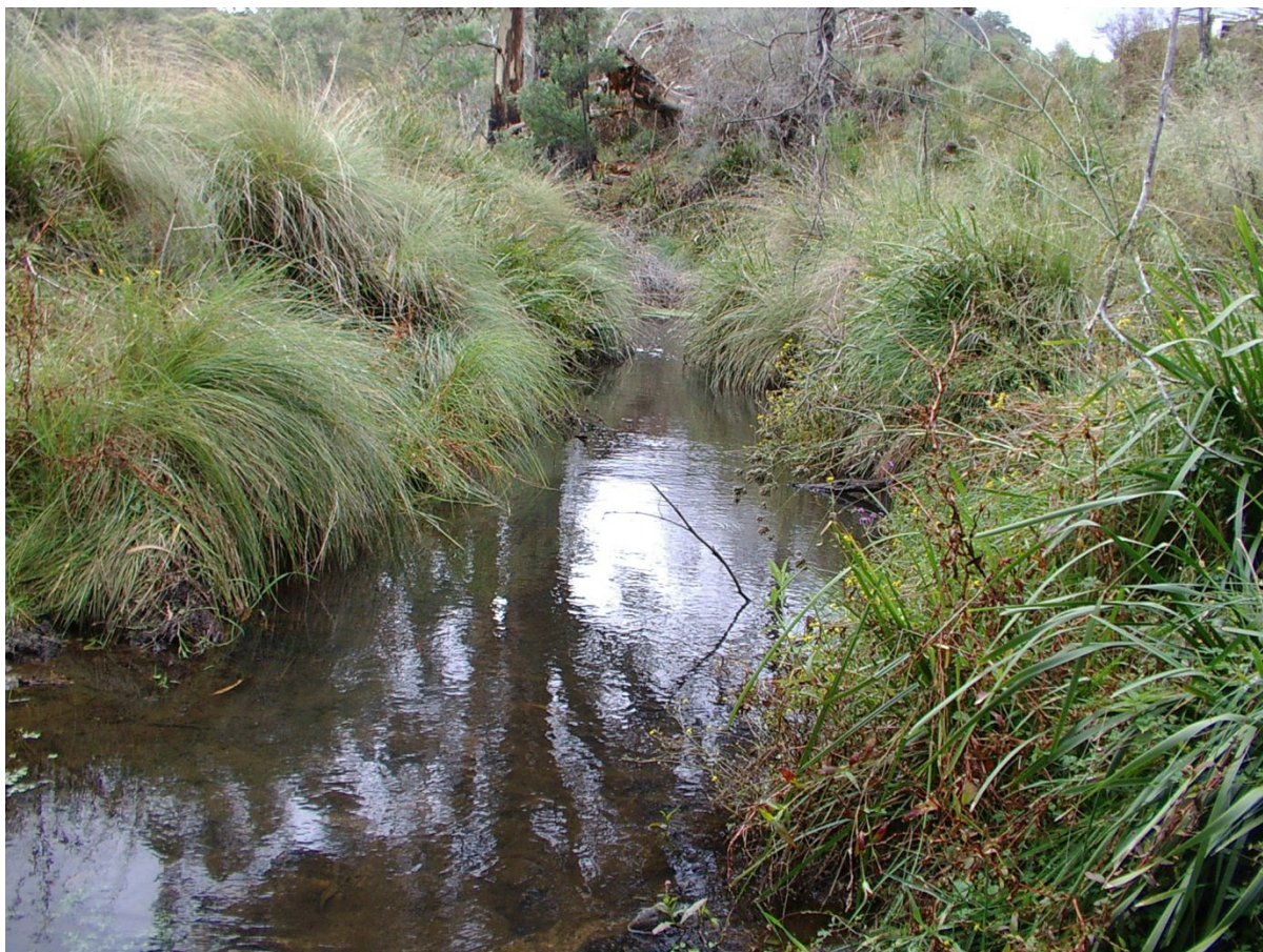
Figure 3. Habitat of E. vesper , upper Cudgegong River, Coricudgy State Forest, NSW ( McCormack and Ah Yong 2017 ).

The habitat requirements of the species are poorly understood. The habitats of the Cudgegong River and its tributary streams where the species is found are perennially flowing and clear with deeper pools (0.5–2 m deep) interspersed with shallow riffles and cascades ( McCormack and Ah Yong 2017 ). These habitats occur through both forested areas as well as grazing paddocks with limited canopy and grassy banks ( McCormack and Ah Yong 2017 ). It is believed that larger E. vesper prefer deeper areas with juveniles found in the shallow margins and under rocks along the side of riffles. Undercut banks with vegetation cover (including Lomandra sp.) overhanging the stream edges is also favourable habitat.