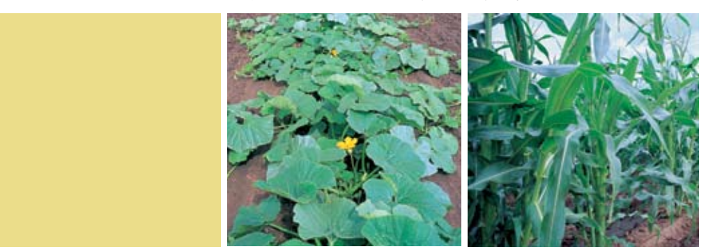
Pumpkin and sweet corn are major users of irrigation water in Queensland.

Lettuce is the most valuable individual crop south of Gympie (Table 6), with tomatoes and potatoes also traditionally important in three of the four southern regions. Other valuable crops on the South Coast, Lockyer–Fassifern, granite Belt and Eastern Darling Downs are sweet corn, french beans, brassica vegetables, onions, carrots and capsicums. Melons and watermelons are valuable vegetable crops on the Western Darling Downs.