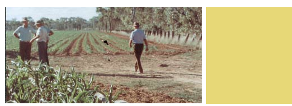
Large corporate and family business farms will continue to dominate some sectors.

north of Rockhampton. The largest producer of hand-picked green beans is in the Gympie area of the South Coast region