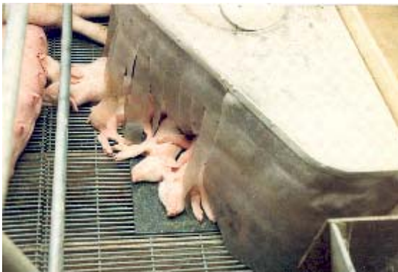
A Nurtinger style kennel in the creep area

The temperature is slowly dropped 1°C per day from the 40°C on day one down to about 29°C to 30°C on day 10 after birth.