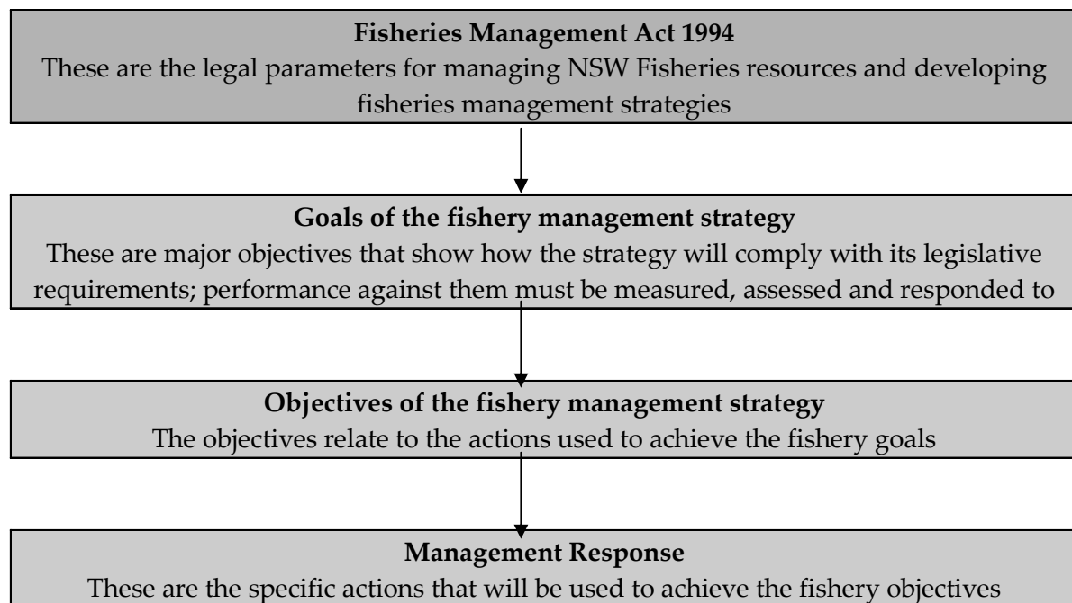
Figure D2. Goals, Objectives and Responses in the Fisheries Management Strategy.

In practice, many of the management responses can achieve multiple objectives and even several goals. Figure D3 shows one example of how a single management response can affect several goals and objectives.