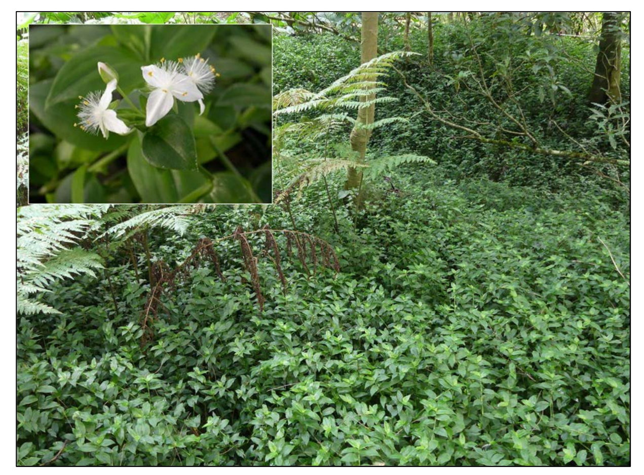
Figure 1 : Wandering trad ( Tradescantia fluminensis ) flowers and dense infestation associated with a reduction in native vegetation diversity (Kangaroo Valley, NSW).