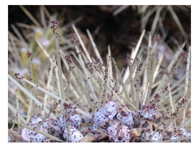
Left: an infestation of Hudson pear; Right: Hudson pear covered in the cochineal.