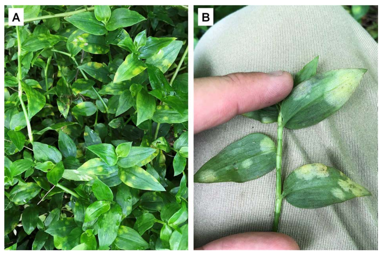
Figure 2: Disease symptoms caused by the leaf-smut fungus Kordyana brasiliensis on leaves of wandering trad ( Tradescantia fluminensis ). These are characterised by diffuse chlorotic (i.e. yellowish) spots on the upper surface of leaves (A) and corresponding whitish lesions on the under surface of leaves where fungal spores are released (B). Lesions become necrotic as they mature, eventually causing complete necrosis and death of leaves. (B. Gooden; Kangaroo Valley, NSW).