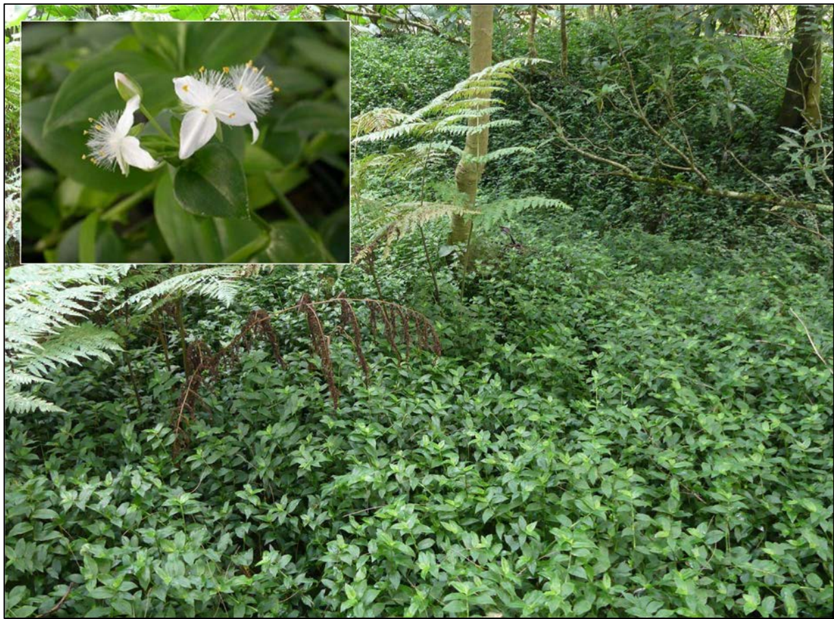
Figure 1: Wandering trad ( Tradescantia fluminensis ) flowers and dense infestation associated with a reduction in native vegetation diversity (B. Gooden; Kangaroo Valley, NSW).