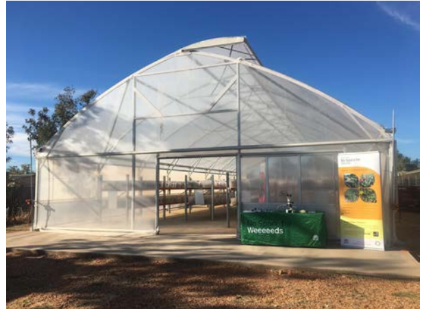
The new biocontrol mass-rearing facility at Lightning Ridge.

For the next two years, the rearing facility at Lightning Ridge will focus exclusively on mass-rearing the Hudson pear cochineal to tackle the core invasion in north western NSW. To fast-track release of the Hudson pear cochineal, landholders can swap tubs of fresh Hudson pear segments (cladodes) for tubs of segments containing the biocontrol agent.