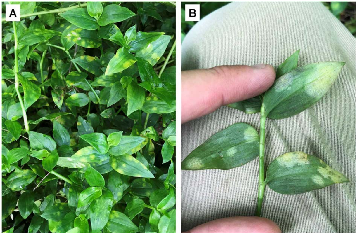
Figure 2: Disease symptoms caused by the leaf-smut fungus Kordyana brasiliensis on leaves of wandering trad ( Tradescantia fluminensis ). These are characterised by diffuse chlorotic (i.e. yellowish) spots on the upper surface of leaves (A) and corresponding whitish lesions on the under surface of leaves where fungal spores are released (B). Lesions become necrotic as they mature, eventually causing complete necrosis and death of leaves. (B. Gooden; Kangaroo Valley, NSW).