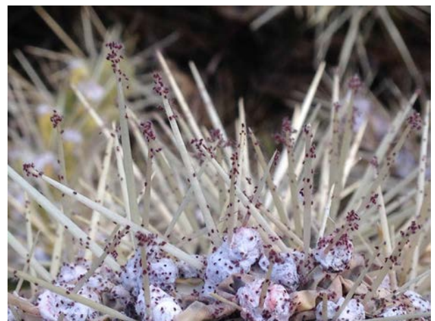
Left: an infestation of Hudson pear; Right: Hudson pear covered in the cochineal.