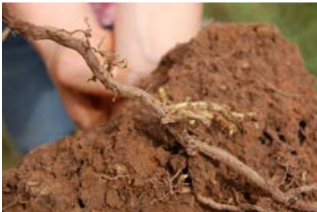
Figure 41. Galls on grapevine roots.

stage so there is no egg production and no gall production (Powell and Krstic, 2015). Phylloxera tolerant rootstocks are those on which phylloxera can feed, reproduce and cause galling (nodosities) Rootstocks used commercially in Australia are considered to vary in their resistance, or tolerance, to different phylloxera strains, and research continues in this area.