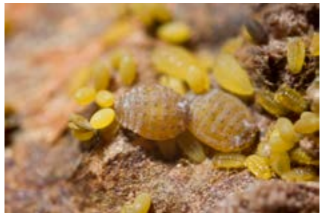
Figure 40. Phylloxera adults, nymphs and eggs.

adult stages. Adult phylloxera are 1 mm long and yellow to brown in colour (Figure 40). They feed on leaves and grapevine roots causing death of the grapevine within 5-6 years on average; but this depends on which endemic strain is present.