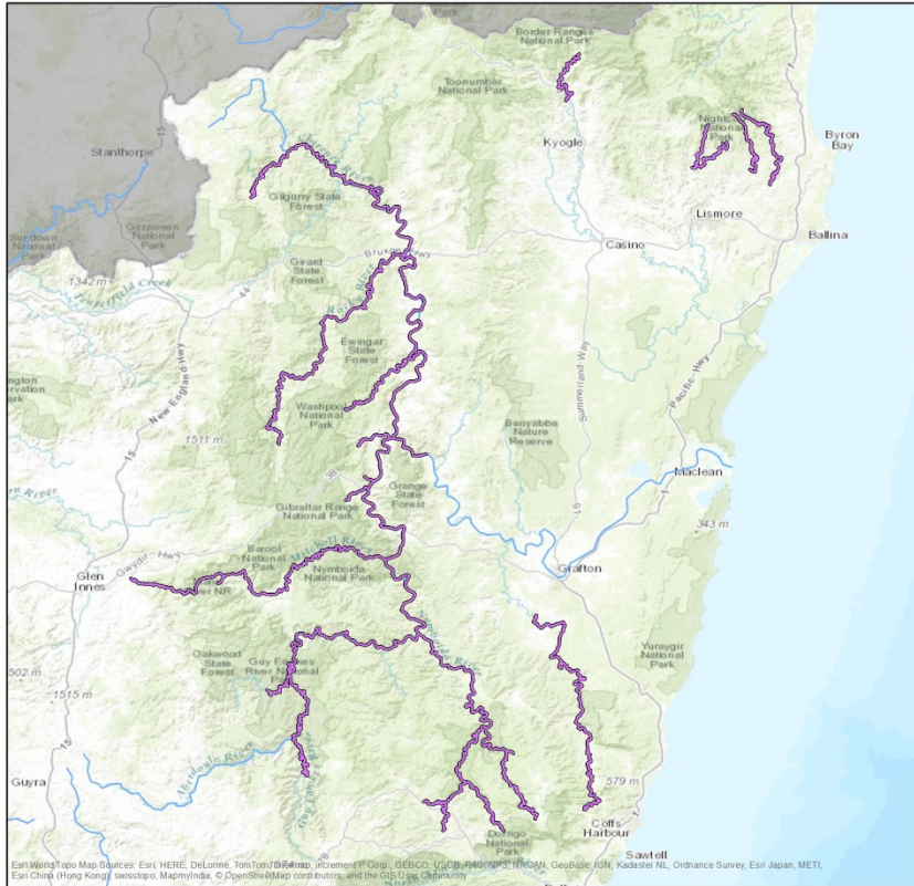
Indicative Distribution in NSW Eastern Freshwater Cod