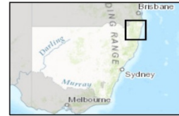
— Indicative Distribution

Distribution based on survey records, predicted occurrence (MaxEnt 3.3.3) and expert opinion. Output restricted to named streams with a modelled average daily flow of more than 5 megalitres, 2015.