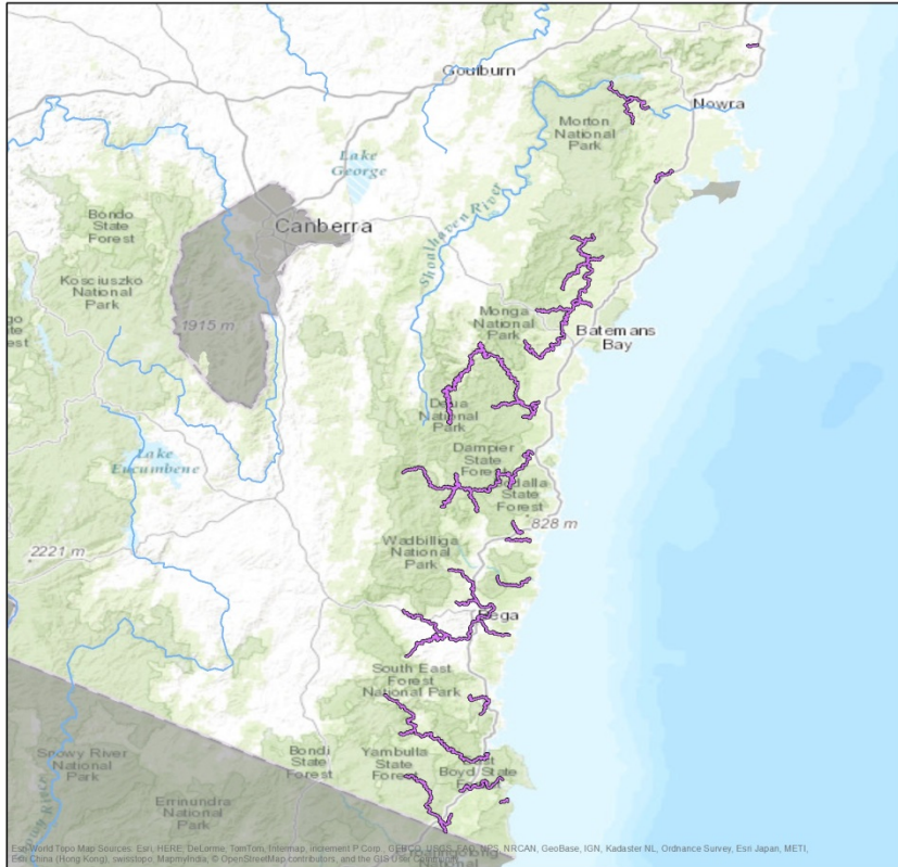
Indicative Distribution in NSW Australian Grayling