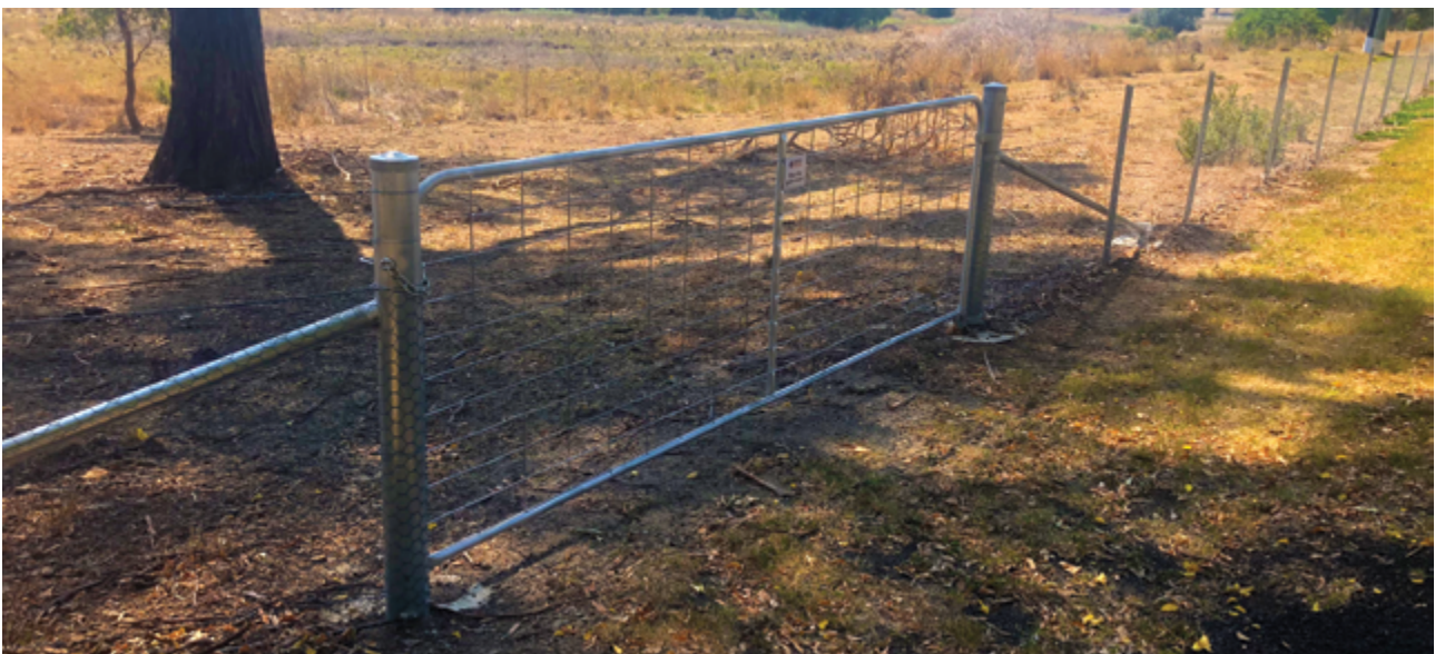
Reconsider the need for costly infrastructure that does not aid drought management. For example, renewing fences often improves the capital value of the farm (useful if it is to be sold) but to the detriment of short term cash flow.

Until the drought breaks, undertake financial literacy training and business planning training. It will give you greater control and leave your business better prepared for the next drought. The NSW RAA has a number of approved workshops under the Farm Business Skills Professional Development Program, which are subsidised by 50% and could be the best use of your time until the rain starts to fall.