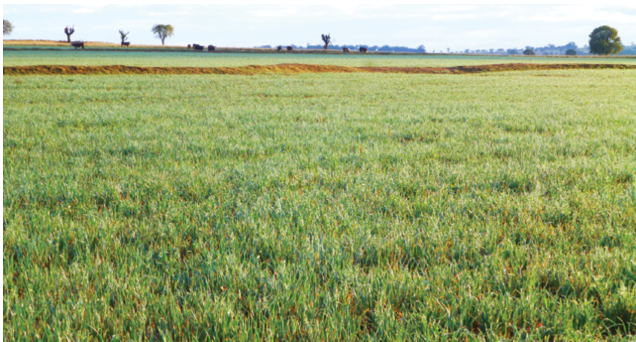
A dual-purpose cereal sown in late February 2018 on good sub soil moisture. Despite the drought this paddock supplied grazing for 120 days at a reduced average level of 1.5 steers/ha and recovered for harvesting.

Deep soil testing down to 1.8–2.0 m can be used on the vertosol soils of northern NSW to estimate PAWC and also soil nitrogen (N). This helps match N fertiliser requirements to soil water. Measuring PAWC for a specific paddock and its characteristics is described in the GRDC Manual: Field measurement of PAWC .