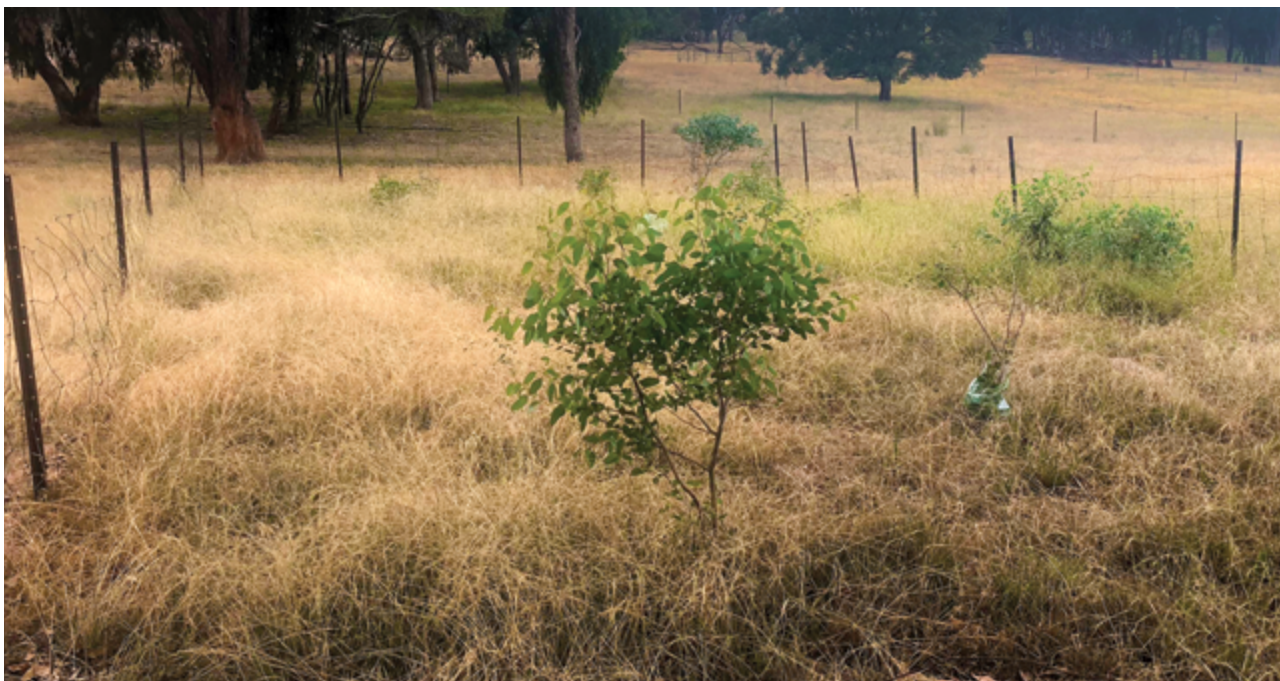
These yellow box ( Eucalyptus melliodora ) trees have been fenced to protect them from stock and wildlife browsing, allowing them to reach beneficial heights more quickly.