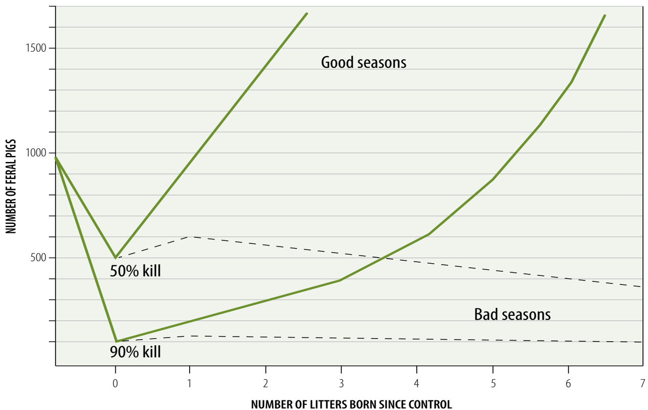
Figure 3. The change in numbers of feral pigs in good and bad seasons after 50% and 90% control kills

As populations retract to areas with permanent water, they can foul those water supplies, reducing clean water availability for livestock. Their concentrated distribution and the lack of cover during drought makes pigs susceptible to trapping and aerial shooting programs. Coordinated and effective control programs during these times can have significant impacts on long-term pig populations.