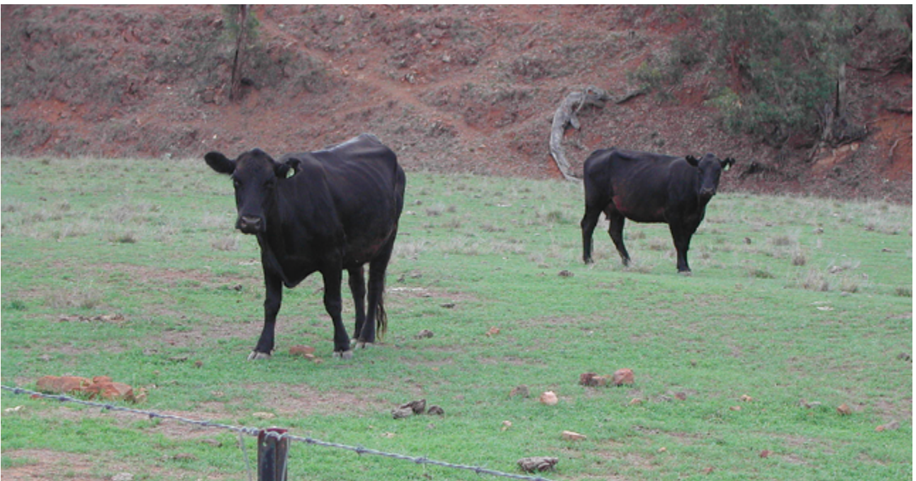
Green pick, the fresh pasture growth after rain, is high in moisture and low in energy and cannot sustain drought affected stock, particularly pregnant and lactating cows.

Drought-breaking rain changes stock feed and water supply rapidly, bringing new challenges to disease management. As well as changes to the quantity and quality of paddock feed supply, stock may be in poor condition, have developed vitamin and/or mineral deficiencies as a result of unbalanced drought rations, or have other drought related health issues.