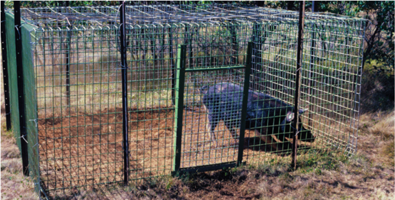
Targeting feral animals during drought when they congregate around dwindling water supplies, keeps their numbers lower for longer during recovery.