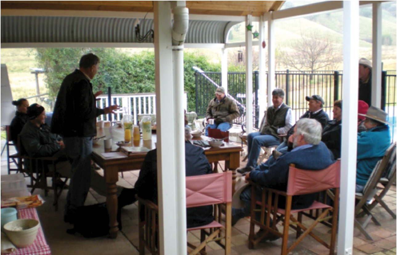
Producer discussions on animal health, feeding options and pasture management are useful during and after drought both for learning from others' experiences and to reduce social isolation.