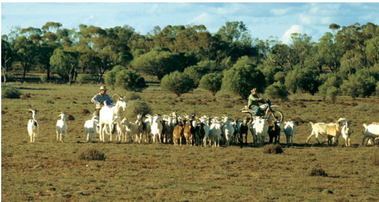
Harvesting goats during drought generates cash flow, reduces pressure on pasture and water supplies, and improves pasture management options during recovery.

The unmanaged grazing pressure exerted by non-domestic animals can make achieving resource condition and grazing targets challenging, particularly during drought recovery when pastures have low biomass. Although the stocking rate of domestic livestock can be readily adjusted relative to available forage, free-roaming animals can graze de-stocked paddocks, limiting attempts to rest and regenerate pastures. The uncertainty about likely forage consumption by unmanaged grazers is problematic when developing fodder budgets.