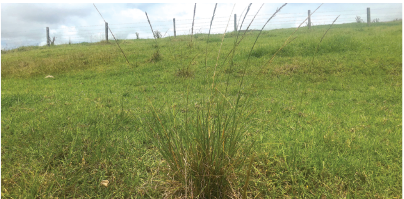
Producers need to be vigilant for high risk weeds that can be introduced with drought fodder. For example, giant Sporobolus grasses (pictured) are serious weeds of coastal New South Wales and Queensland, where hay has been produced and sent to other areas.

Stock movements to agistment properties during drought, and back home again after rain, represent another means by which weeds can be moved. Gathering information about the presence and potential spread of weeds, and implementing management strategies such as stock quarantine, are important in managing this risk.