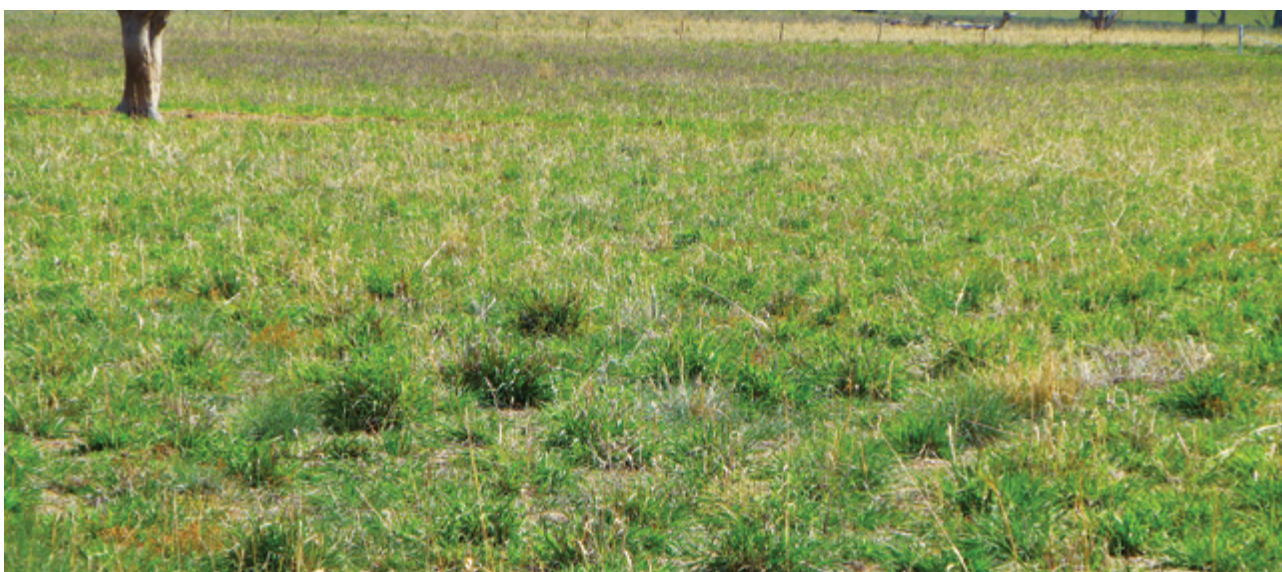
Improved tropical grass pasture that is rotationally grazed to retain ground cover can respond dramatically to rainfall in most months of the year in many areas. Photo Bob Freebairn October 2018