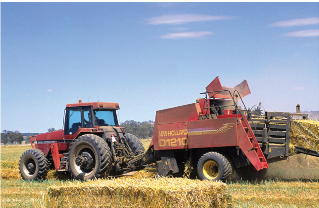
Consider selling capital items to pay down debt. For example, can contractors be substituted for owning machinery?