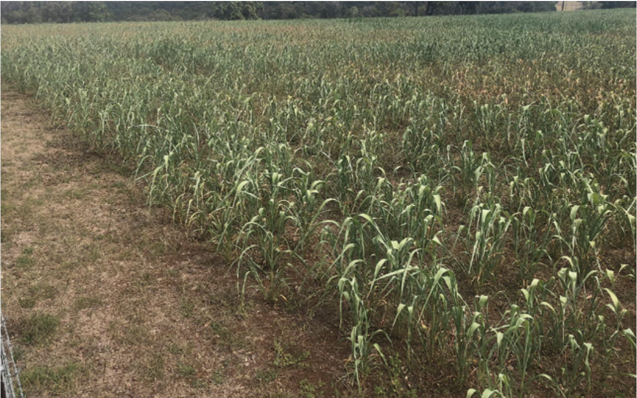
Sorghum re-growth after rain can be high in nitrates and/or prussic acid, and should be tested prior to grazing. Transitioning stock from drought rations to pasture requires care and planning.