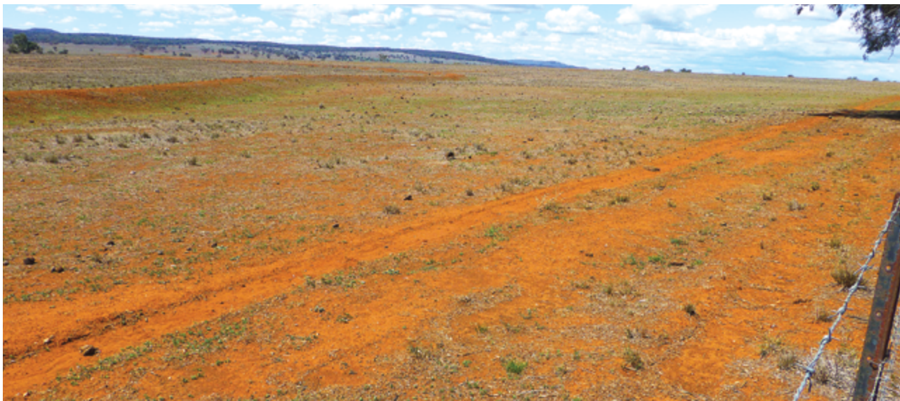
Overgrazed native grass pasture is susceptible to wind erosion, has low water infiltration rate and is very slow to recover. Photo Bob Freebairn October 2018