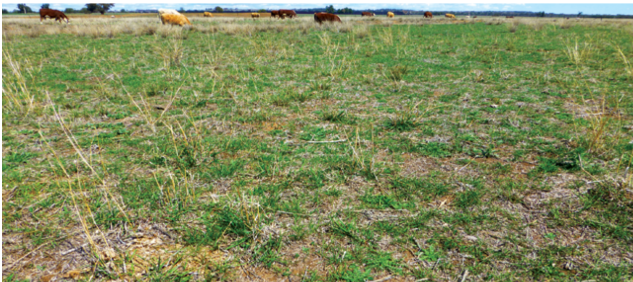
Native grass pasture that has been rotationally grazed with reasonable ground cover retained can respond to rain. October 2018