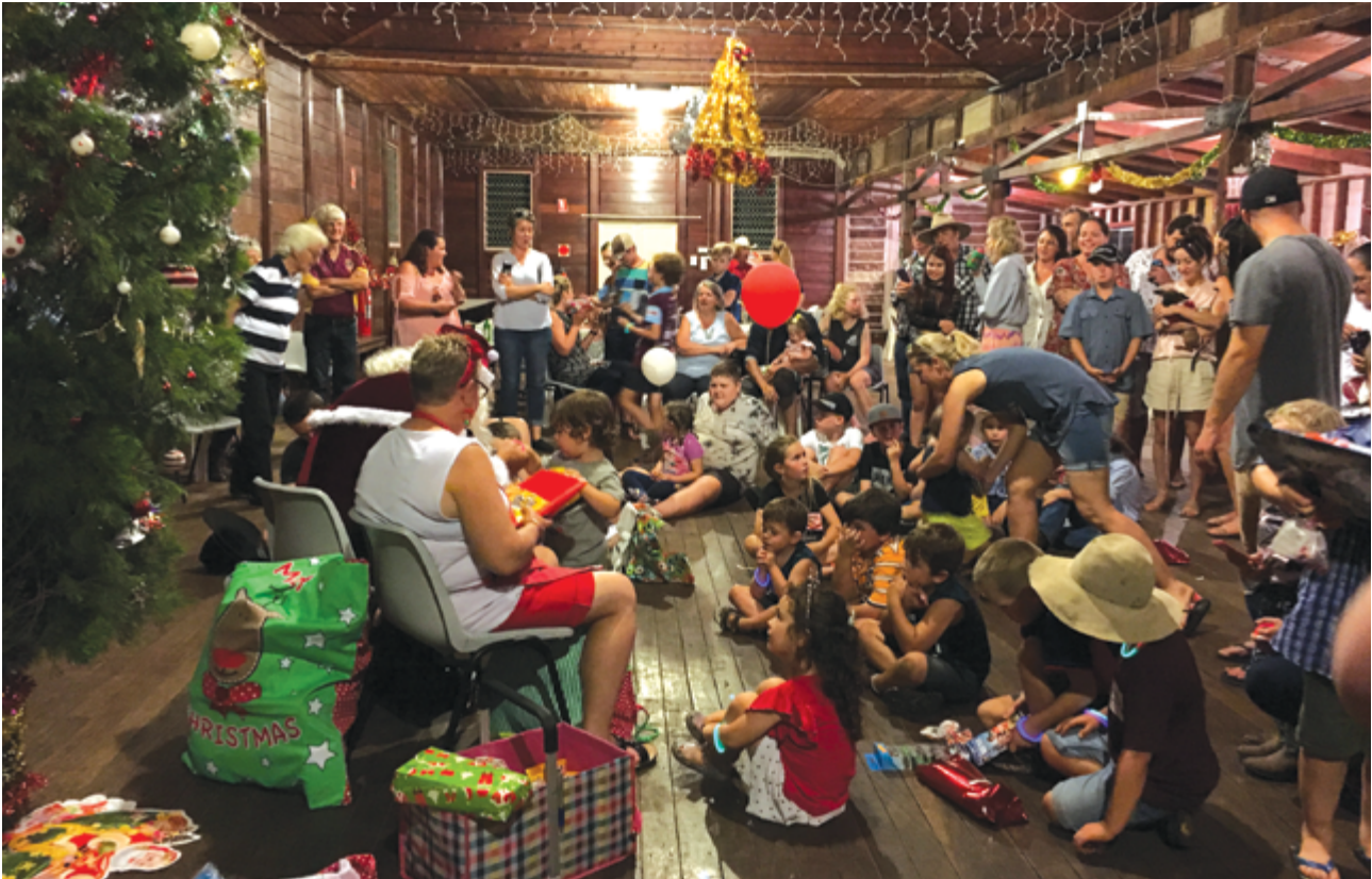
Family gatherings are important in keeping rural communities vibrant and for families to interact and socialise with others.