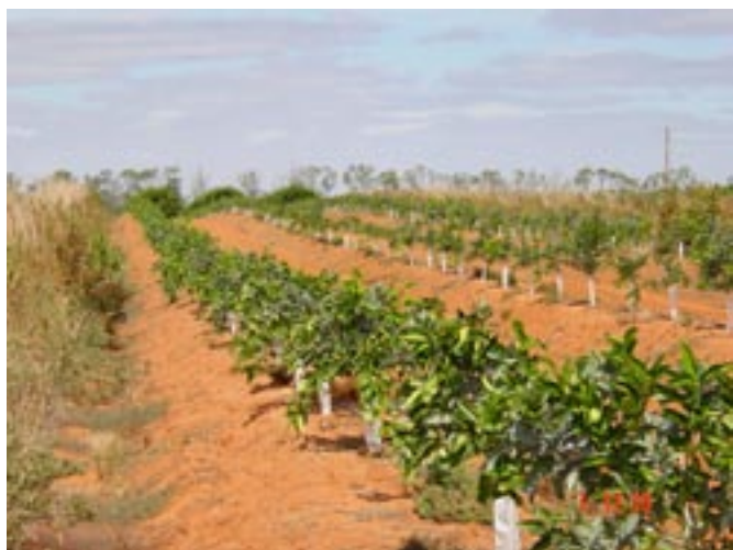
Photo 15: Improved tree growth in rows directly beside the sorghum wind break, using drip irrigation. Trees planted December 2004.

of citrus trees. Trees directly beside the sorghum windbreak show better growth than rows further from the break. For future plantings, Mr Hand will plant a sorghum windbreak every second row of citrus trees. Tree spacings are 7m x 3m for the sprinkler irrigated block and 6m x 2m for the drip block. Mr Hand will plant the sorghum seed at less than the recommended sowing rate so as to achieve good windbreak height sooner and allow more porosity.