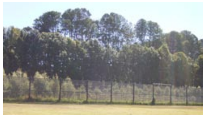
Photo 12: An artificial windbreak

There are examples of using poly mesh over the whole planting. A thorough economic analysis of this would be wise, perhaps targeting particular niche markets. The August 2003 edition of Australian Citrus News contained an article on a 5.5ha fully enclosed windbreak structure. The story reported that this 17% shade hail netting was producing a 98% packout of one of the summer navels.