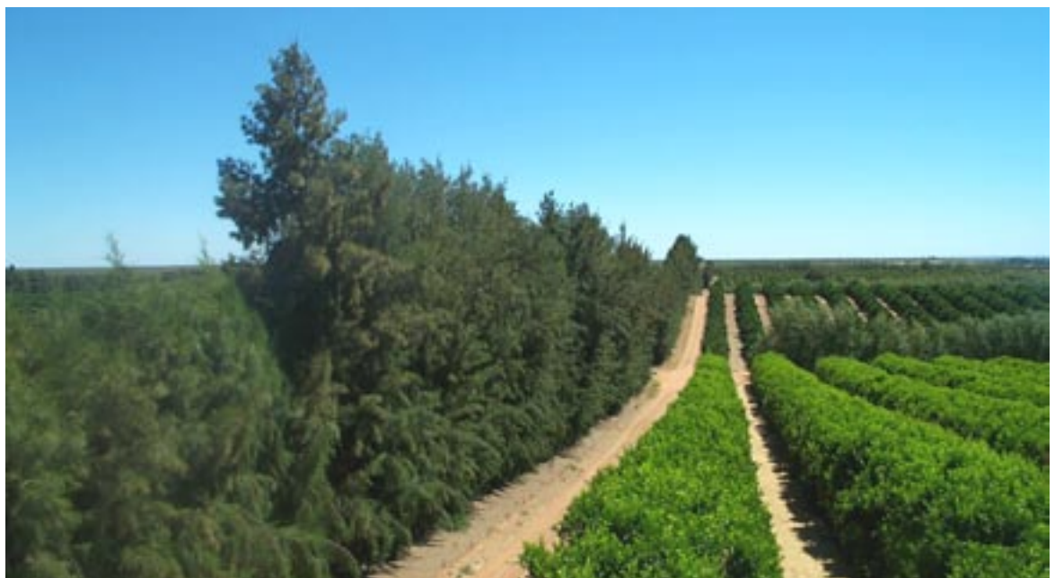
Photo 1: Windbreaks provide protection for trees and fruit resulting in reduced rind blemish.

The geographical location of the citrus planting will partly determine the type of windbreak required. Each citrus growing area and each planting will have specific windbreak requirements. For example, a planting close to the coast with constant multidirectional winds may require a substantial windbreak around and throughout the planting. However in drier