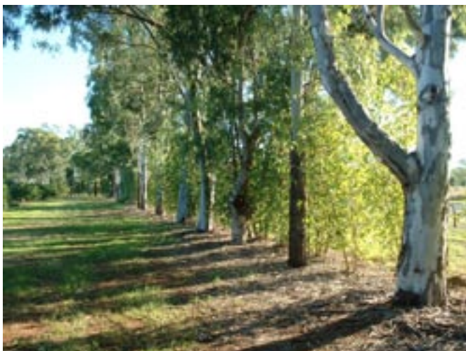
Photo 6: A windbreak of mature Eucalypts inter-planted with bamboo to compensate for the loss of the Eucalypt's lower branches.

Figure 1 indicates one type of windbreak, showing different sized trees, and indicating that the tallest tree does shed its lower branches when mature. This shedding of lower branches would leave a gaping hole if there were no lower storey tree protection. There are also many successful windbreaks using a single staggered row of trees that do not shed their lower branches if pruned correctly. Single rows of specific type bamboo