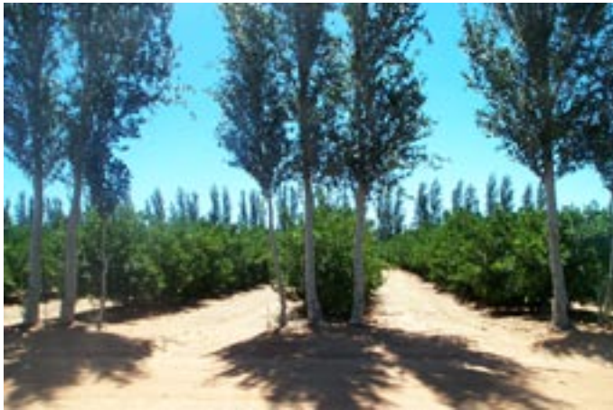
Photo 5: Three Poplar trees are used at the end of tree rows in South Africa and some parts of Australia when there is not enough space for a full windbreak row.

or frosty air. This can result in frost damage to trees and fruit. The windbreak design needs to include an air drainage break in the lowest part of the protected block so cold dense air drains away from the crop.