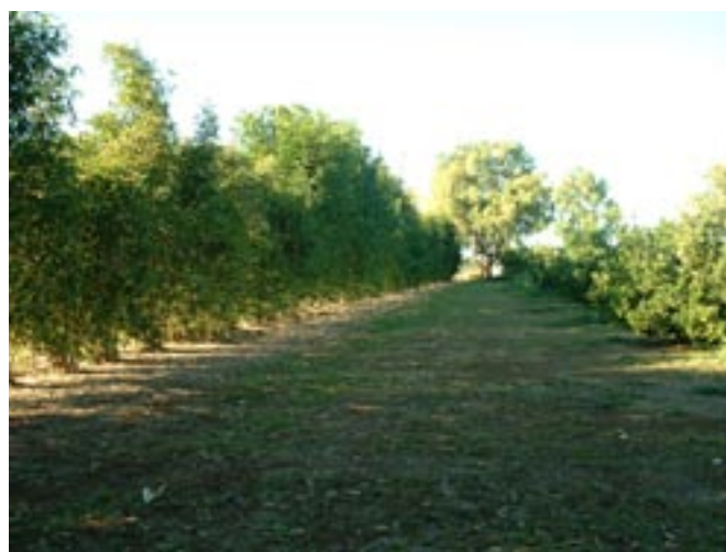
Photo 11: Windbreak trees provide protection but they cause shading. Orientate your windbreak trees in a north-south direction when possible to reduce shading.

reduce fruit quality, flower bud formation and crop yield. A north-south orientation for the windbreak rows will help overcome this problem by giving the adjacent crop rows direct sunlight for at least part of the day. Where the north-south orientation is not possible, the effects of shading must be accepted or the distance between the crop and the windbreak increased. The level of competition will depend on species planted, soil type, amount of water and nutrients applied, distance planted from the crop, final windbreak height, and frequency of pruning. Regular maintenance is critical.