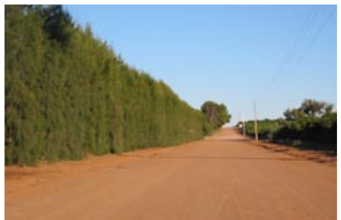
Photo 4: A row of Casuarinas that have been hedged to allow more air permeability and to promote more vertical growth as well as to stop encroachment onto public roads.

Note: The only way to maintain your windbreak at the correct permeability is to have a regular pruning or hedging program in place (at least