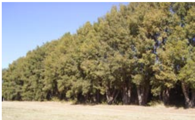
Photo 7 : A row of mature turpentines on the Central Coast of NSW ( Syncarpia glomerulifera ).

which is medium sized, retains its lower branches, is good on heavy soils, salt tolerant and can be hedged.