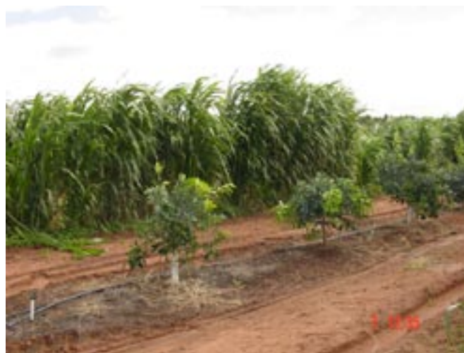
Photo 14: Sorghum windbreaks planted to protect newly established citrus trees under sprinkler irrigation. Trees established Spring 2003.

Rod has established sorghum as a temporary windbreak for protecting young trees. Currently