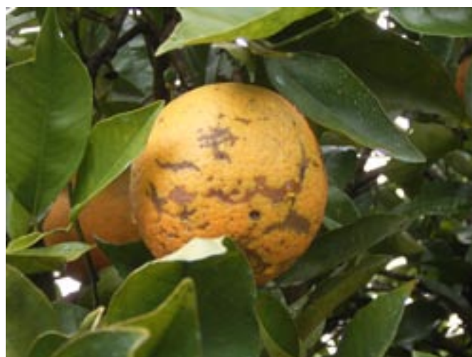
Photos 2 and 3: Wind scarring on fruit is a major cause of fruit downgrading.