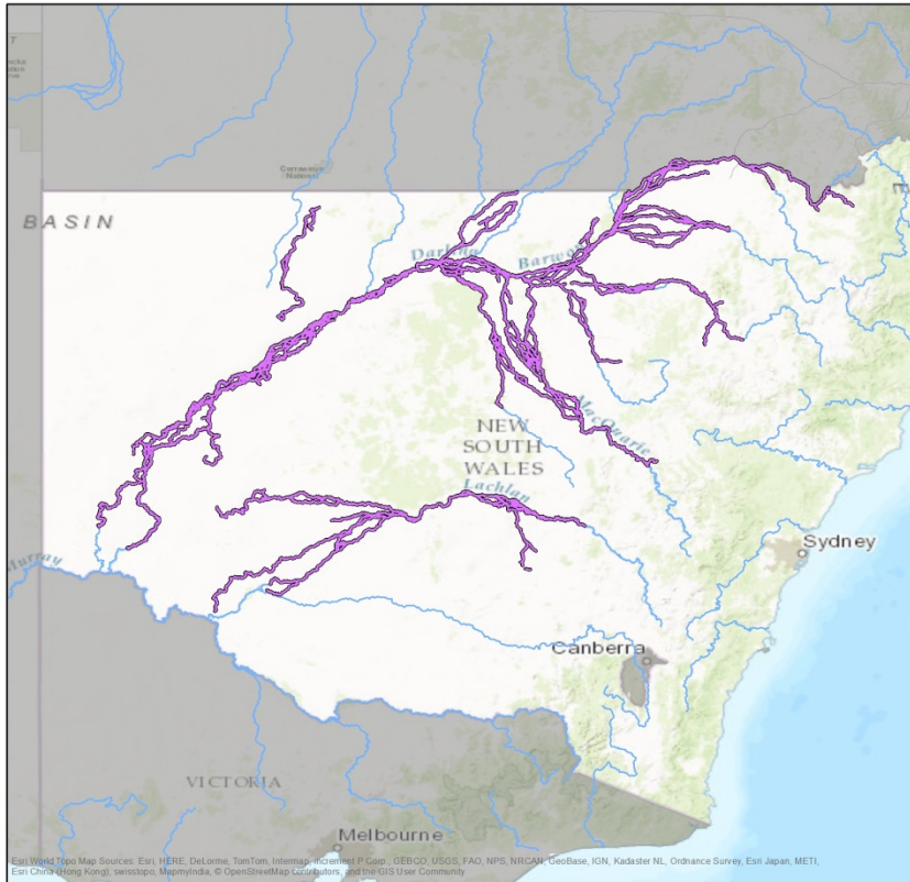
Indicative Distribution in Western NSW