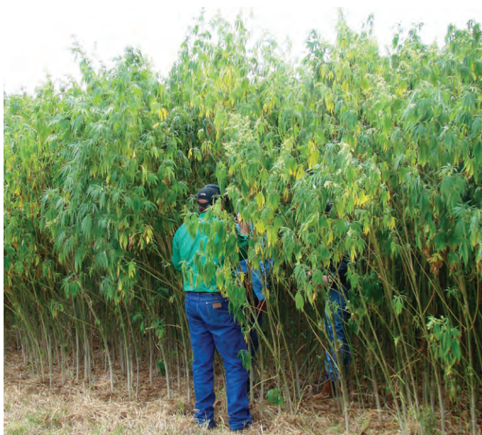
Figure 3 - Inspecting a mature Upper Hunter hemp crop.

The concentration of production in the Upper Hunter region is also encouraged by the high yields possible due to reliable water supplies and experienced growers. The average of 10 tonnes/ ha of hemp produced in the Upper Hunter region is 87% higher than the NSW average (see Table 2). The high returns for hemp also make it suitable for modest farm sizes.