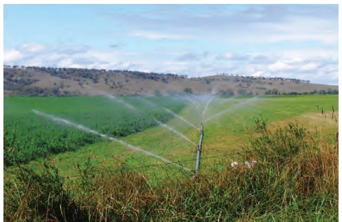
Figure 4 - Irrigated Lucerne on alluvial lands near Jerrys Plains

Importantly the Upper Hunter region also provides an expanding market for lucerne sale to equine studs. Being able to produce a low density bulky commodity in close proximity to key market outlets is a major competitive advantage.