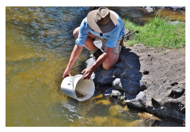
Figure 3: Trout Cod fingerlings being stocked into the Macquarie River in December 2016.

Strategy (2005). NSW DPI continues to monitor stocked sites to gain a clearer understanding of the effectiveness of the stocking program in contributing to Trout Cod recovery.