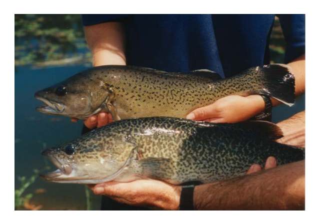
Figure 2: A Trout Cod (top) and a Murray Cod (bottom).

should be used to distinguish Trout Cod from Murray Cod. Distinguishing features of the Trout Cod include an overhanging upper jaw, a longer and more pointed snout, a straight head profile and relatively large eyes.