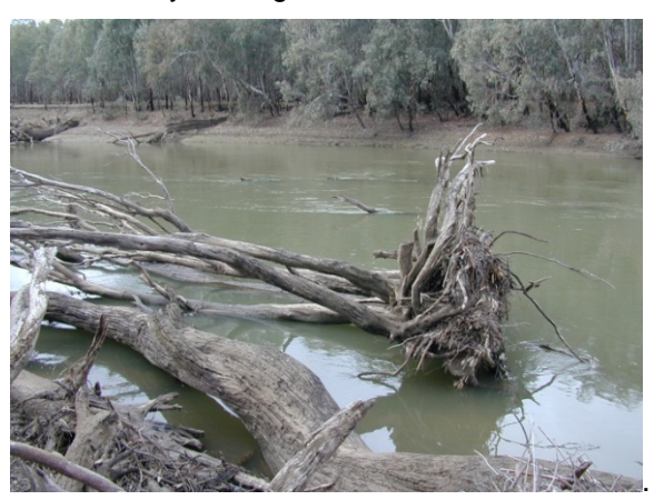
Figure 4: Trout Cod tend to occupy areas which have lots of large in-stream woody debris.

The review found that many specific recovery plan objectives have been completed in the last 10 years or are ongoing. Significant improvements in Trout Cod population size and distribution have occurred since the recovery plan was implemented in 2006 and there is optimism for the recovery of the species. However, self-sustaining populations have only been established in a small percentage of the species' historic range indicating further work is still required to establish self-sustaining populations of Trout Cod across its historic range in the Murray-Darling Basin.