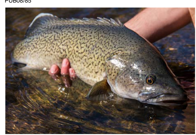
Figure 6: An adult Trout Cod