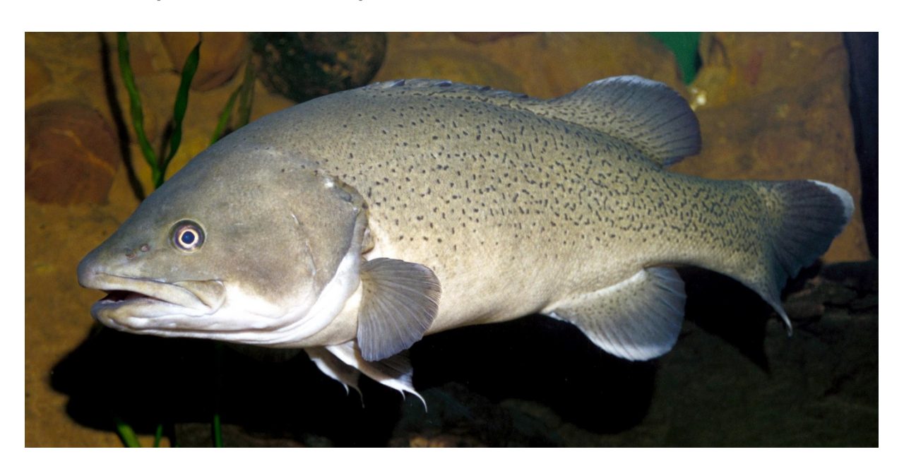
Figure 1: A Trout Cod.

February 2017, Primefact 185, Third edition Threatened Species Unit, Port Stephens Fisheries Institute