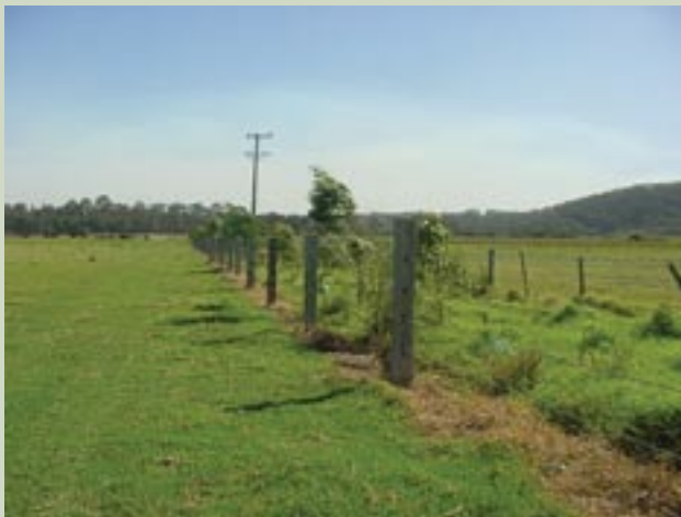
This tree lot was planted in 2001. Photo taken December 2002.