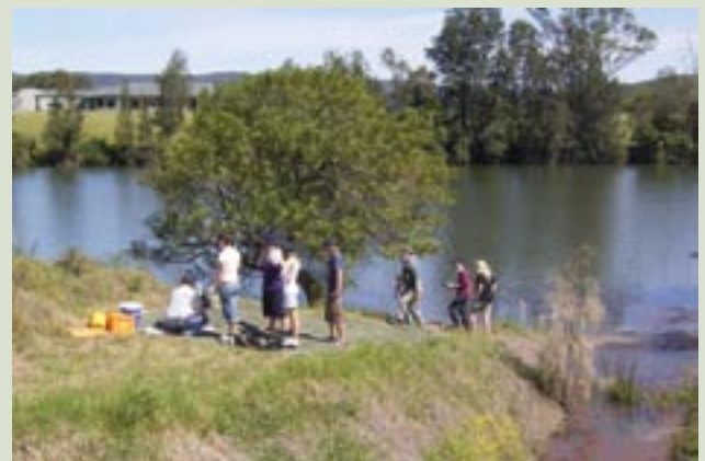
School students involved in an Envirothon event held at the property in October 2005. The challenge for the students was to identify what environmental issues faced the property.