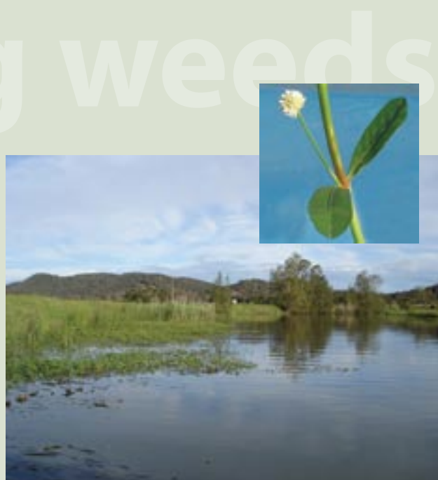
Invasion from Alligator Weed is threatening landholders along the Williams River. Alligator weed, with its ball shaped white flower and hollow stems (inset), spreads rapidly across the surface of water. Easily broken fragments can quickly re-establish.