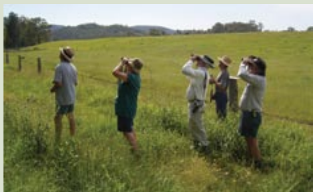
Bird watchers in action along the riverbank.