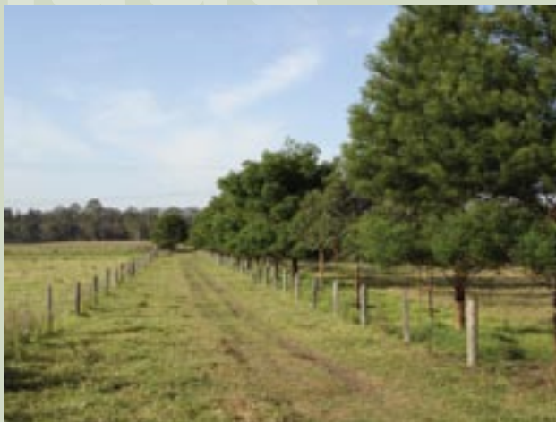
Three years later cattle have access to paddock shade and a laneway has been created.