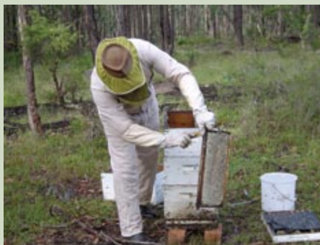
Above and below: Beekeeping has provided an opportunity for diversification.