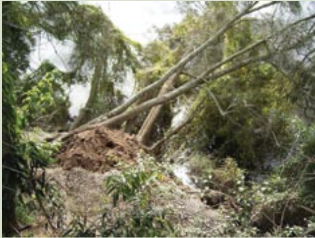
Severe erosion on the riverbank. This occurred on a straight section of riverbank after a river 'fresh' in June 2004. Riverbank restoration was integral to our whole farm plan.