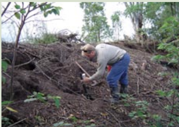
Fumigating rabbit burrows following weed removal.

Over the years, we have controlled feral animals in a haphazard way. When baiting for foxes one year, we realised the interaction between foxes and rabbits, noticing that controlling the foxes resulted in a dramatic increase in the rabbit population. While biological controls with the calicivirus and myxomatosis were reducing rabbit numbers, results varied with the season, and at times the rabbit numbers reach plague proportions.