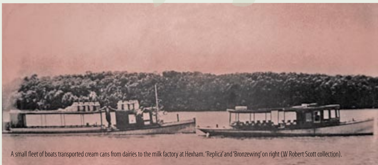
A small fleet of boats transported cream cans from dairies to the milk factory at Hexham. 'Replica' and 'Bronzewing' on right.