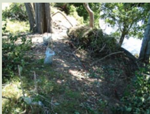
Weed removal by experienced bush regenerators showing high density Lantana. The Lantana that has been removed was piled up to create wildlife habitat.