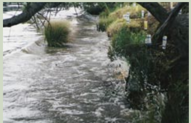
The destructive force of boat wash makes our efforts to plant protective vegetation difficult.