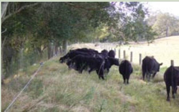
Cattle crash grazing along the riverbank with permanent riverbank fence on the right, a temporary electric fence protects recently planted tubestock. A small mob of cattle for a short period leaves a denser pasture than normal paddock grazing.

Managing these areas differently to the paddock was the biggest change for us. The laneway along the river became a drought reserve—a kind of 'long paddock' or 'living haystack'. Other areas are crash-grazed by lighter animals during winter when pasture in other paddocks becomes short. Grazing these areas for short periods leaves more vegetation intact than in a paddock, and a long rest interval allows more vegetative growth.