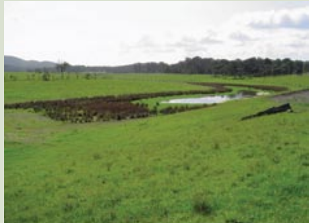
A lagoon wetland connects to the river via a drainage channel and floodgate. The wetland and channel has been fenced using two-strand electric wires and galvanized star pickets.

Also using the funding available, we constructed a number of small bridges to remove the impacts of cattle on the drains.