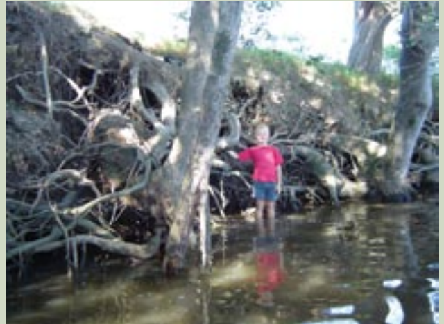
A section of riverbank undercut to 2 m. Not even the tree roots were able to hold the soil together.

The search for an effective solution continues.