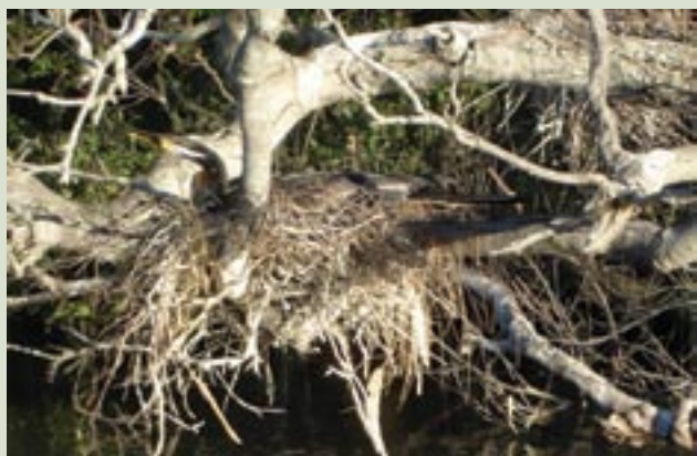
Darter nesting in a fallen tree on the river.

There is nothing more refreshing than to have a hectic schedule on the farm interrupted by the spectacular flight of a bird, or to be distracted, anxiously waiting to see if the raptor captures its prey. We now often take just a minute or two to listen to the Thornbills chattering or to watch the Wrens darting amongst the vegetation.