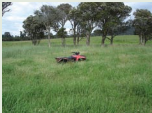
Pasture growth across low areas of the property during summer.

Lime is one other essential part of the puzzle. We need to be aware of major nutrient deficiencies such as phosphorus and ensure we have a balance of legumes in the pasture mix to provide enough essential nitrogen for plant growth.