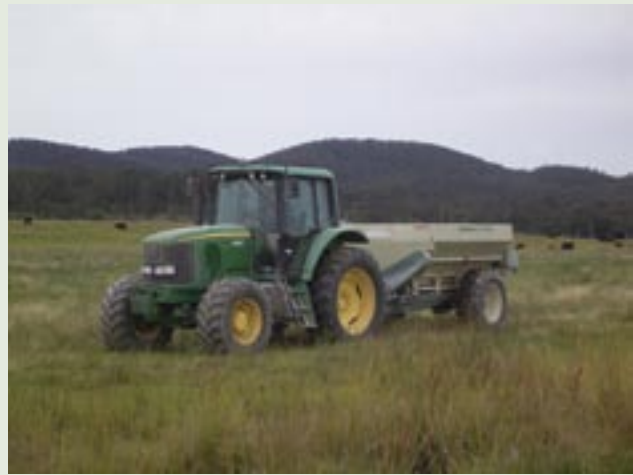
Ground spreading lime to improve soil pH and chemical balance.

Our application rate is commonly 2.5 tonnes/ha, which raised the soil pH in the top 10 cm by 1.0 pH unit in the first 12 months, with a residual effect expected to continue for a number of years.