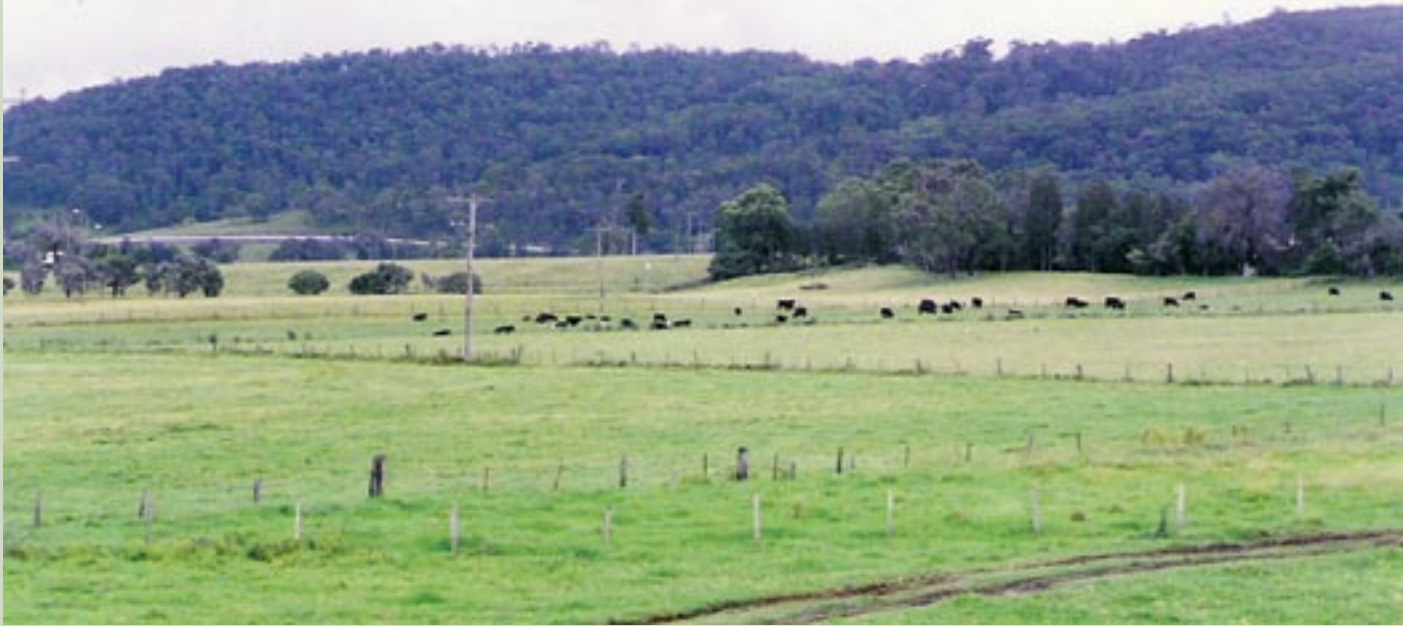
In April 1999 the only shade for stock was along the river.