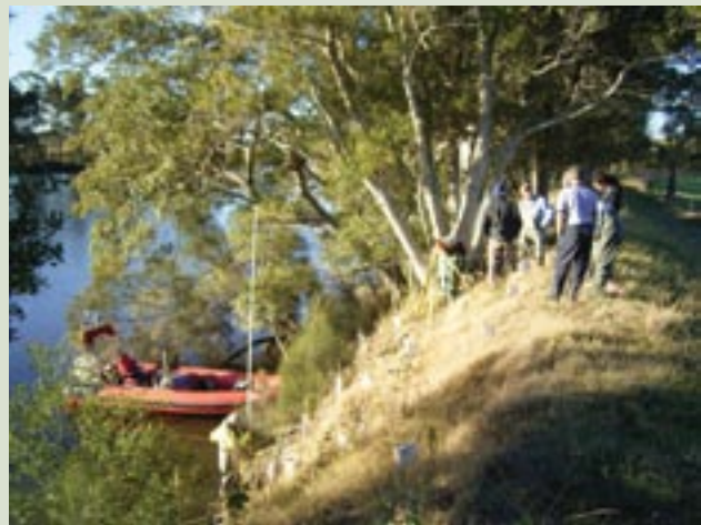
The initial survey of riverbank profiles was conducted with assistance from University of Newcastle and NSW Maritime Authority. Surveying is repeated annually to assess the rate of riverbank erosion.

Having established this baseline data, we re-surveyed in early 2006 and noted that some sites showed more than 500 mm of erosion in just 12 months. We believe these surveys will prove useful as indicators of river changes.