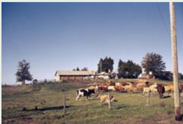
O'Keefe's dairy 'Hilmont', 1966. Dairying was traditionally the main agricultural activity. Today only a handful of dairies remain in the area. (O'Keefe collection)