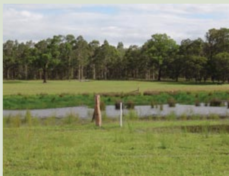
A piezometer test well monitors water table depth in the acid sulfate soils area.