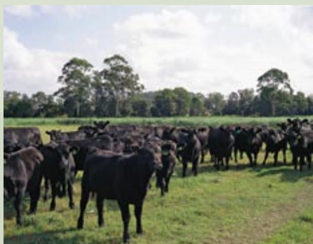
Greswick Angus is a Cattlecare accredited grazing operation with properties in the lower and upper Hunter Valley, producing breeding bulls and replacement heifers. The home property 'Hilmont' of 140 hectares (350 acres) has 3 km of frontage to the Williams River that provides drinking water for Newcastle and lower Hunter communities.