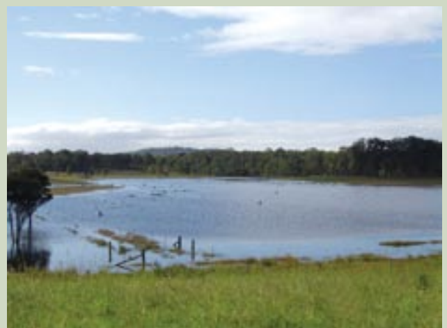
Below: Same area after 95 mm of rain in March 2005.