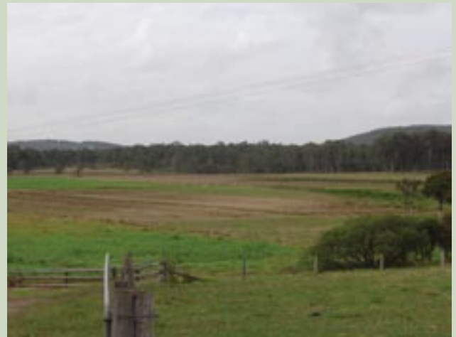
Above: Pasture improvement in the low-lying paddocks across the property.

Establishing more productive pastures allows better utilisation of grazing areas, greater filtering capacity and more nutrient cycling. Nutrients moving below the root zone by leaching or being moved off the paddock by run-off potentially causes higher fertiliser costs and may reduce water quality in the Williams River.