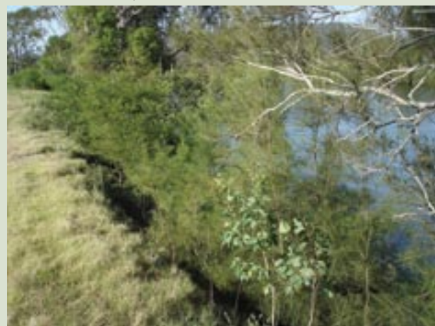
Below: Same area three years later. Photo taken December 2005.