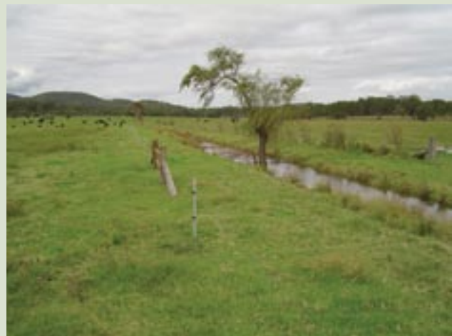
Drainage channels have been fenced to control cattle access. A buffer between the drain and the fence allows for machinery maintenance of the drains and slashing along drain edges.