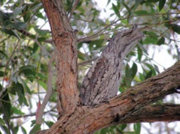
Tawny Frogmouth (Photo courtesy Tom Clarke Hunter Bird Observers Club).

Our favourite Tawny Frogmouth birds have returned to raise their young in a remnant forest just below our house, and regularly feed off the lawn at dusk. The colourful Azure Kingfisher and Rainbow Bee-eater are exciting to watch as they follow our canoe along the river. It is exciting to see the return of the Latham's Snipe migrating from Japan back to our wetlands.