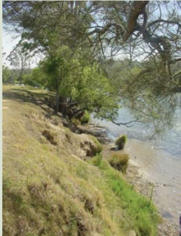
Above: A typical section of riverbank suffering from the stress of cattle access. Photo taken December 2002.

Trees are likely to improve the capital value of the land through aesthetic improvements alone. However, that million-dollar view of the river is also important for some people buying into a rural lifestyle.