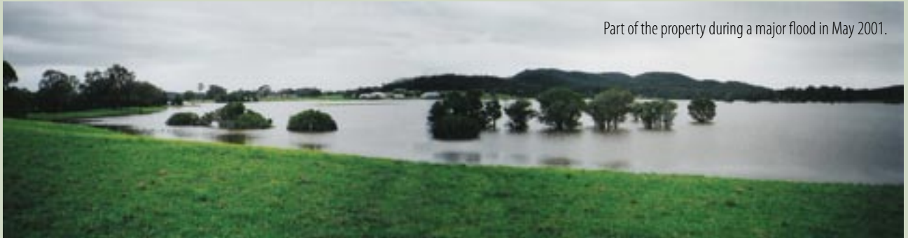
Part of the property during a major flood in May 2001.