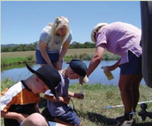
Regular water testing of farm dams, drainage channels and wetlands helps us monitor changes.

Our objective is to maintain or improve the quality of water leaving the farm, thereby keeping the nutrients where they are needed; in the paddock and on the farm.