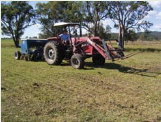
Direct drilling of pasture to minimise soil disturbance.

Before soil testing, it was common practice to use single superphosphate (SSP) as a blanket application across most of the farm. We didn't even realise that some paddocks in fact had an excess of phosphorus (P).