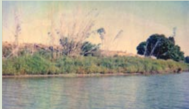
Shoreline in the 1960s showing an abundance of river reeds. There is no apparent erosion.

What we have achieved in such a short period of time only scratches the surface of what's truly achievable. What we've done is not new, but we have adapted sound ideas for our property using a structured and planned approach. It's not a 'one size fits all' formula. We are taking the time to find that comfortable balance that suits us and our land.