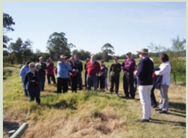
Field days provide an opportunity to showcase our work. This is a tour group of Victorian Angus beef producers.

Operating in the primary industry sector is an ever-changing environment. Education is a life-long process and we are committed to keeping abreast of industry changes as a way towards a sustainable future.