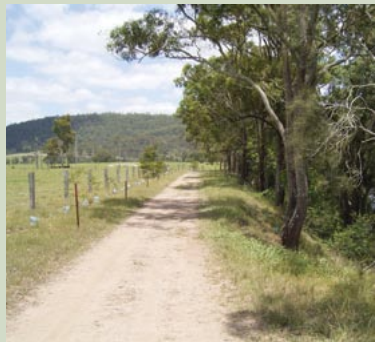
A laneway along the riverbank aids movement around the farm.

We spent a lot of time observing cattle movements around paddocks, mapping cattle camps and tracks to understand livestock grazing behaviour.