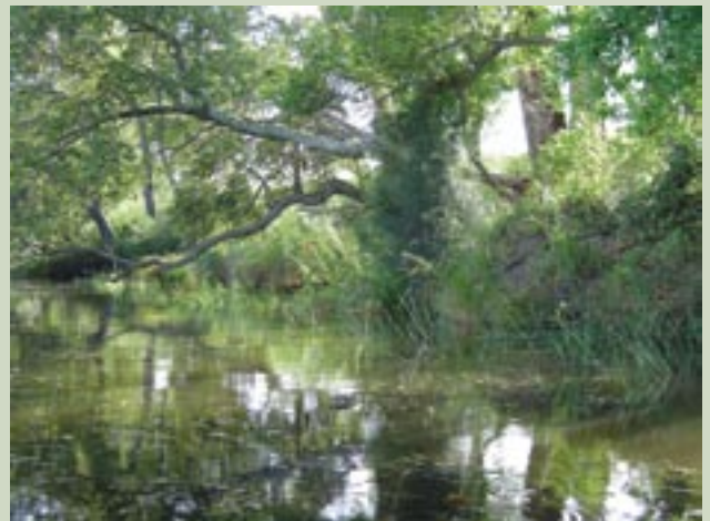
Six different species of aquatic vegetation were trialed along undercut sections of the riverbank to act as vegetative barriers. Aquatic planting January 2005.