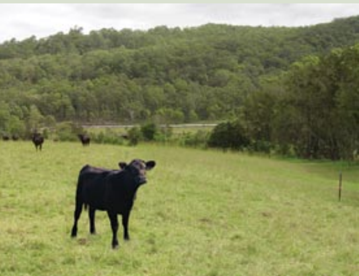
A temporary electric fence is used to control cattle access to the steeper part of the paddock. Grass left on the slope is higher and more dense than the rest of the paddock, giving greater protection to, and less runoff from the slope.

With our highly-improved pastures costing more than $300/ha to establish, we needed to match this outlay with a suitable class of livestock—in this case breeding bulls—that could produce a good return on pasture investment.