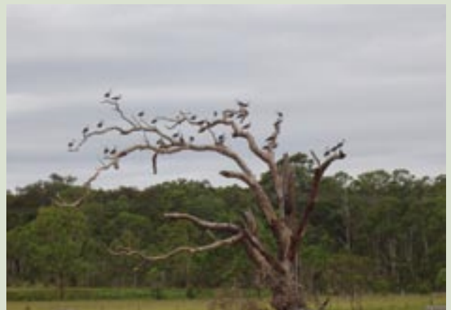
Ibis taking a rest in a dead tree above a waterlogged paddock.

Now that we are aware of their benefits, our plan is to maintain and improve bird habitat. A diversity of native trees and shrubs will encourage them to stay.