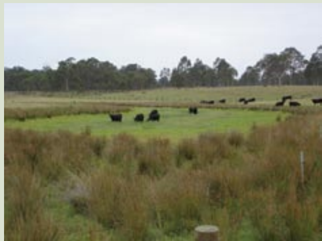
Cattle grazing the wetland during a dry period.