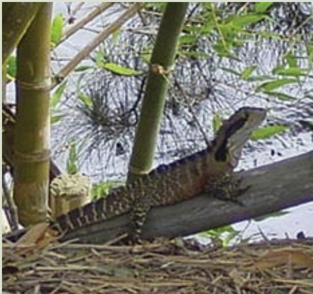
Water dragon lizards are common along the riverbanks.

The result of funding support was to help us improve our productivity while farming less land area and allow us to manage sensitive areas for their biodiversity value.