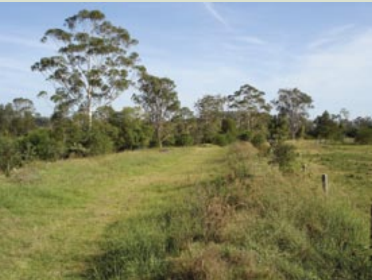
Crash grazing area along the river. Note paddock fence on right hand side of levee and tree planting for replacement shade in paddock. Area between riverbank fence and river can still be used for access or strategic grazing.

We could not rely on electric fencing alone, as our stud breeding program and isolation during floods meant this style of fencing would be inappropriate.