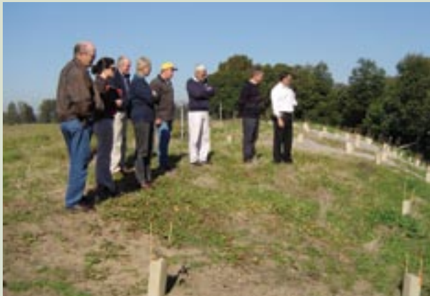
The BMP project steering committee members keep a close eye on the progress of on-ground works.

NSW Government Environmental Trust Hunter-Central Rivers Catchment Management Authority Hunter Water Corporation NSW Department of Primary Industries Port Stephens Council Rural Lands Protection Board