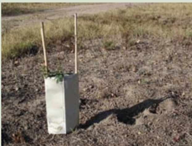
Healthy native tubestock defoliated by rabbits. Note the bare patches and scratch marks around the plant and rabbit dung in the background.

The impacts of rabbits on the landscape were becoming obvious on our tree planting. Tubestock plants were nipped off, and rabbit burrows in the soft sandy soils were further destabilising the riverbanks.