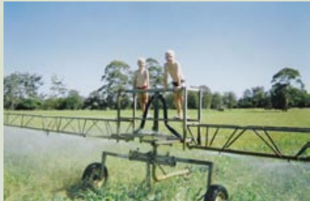
Low pressure boomspray irrigation on summer forage sorghum. Our boys cooling off while checking its operation.

Having access to fresh water for irrigation is one of the luxuries of where we live. Although average annual rainfall is around 1140 mm, it is also extremely variable, with dry springs and long, hot humid summers becoming more common.