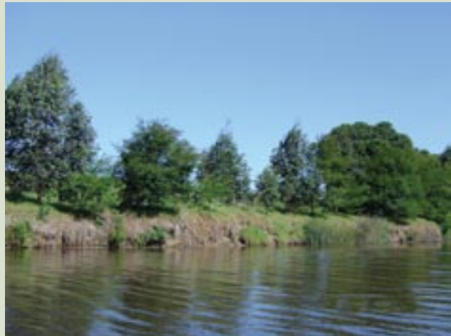
The same area in December 2004. The bank is severely undercut and has slumped. Revegetation began in spring 2001 and continues.